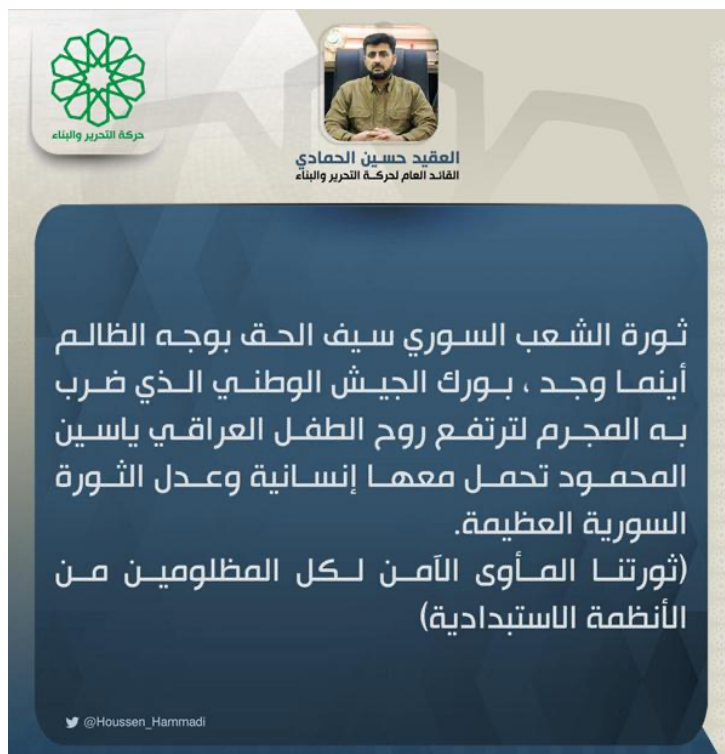
Image (2) - The statement of the Media Office of the Eastern Army congratulating the killing of the suspect. Published by Colonel Hussein al-Hammadi, the leader of the Eastern Army and the general commander of the Liberation and Construction Movement ( Link to the original tweet, accessed on 08 November 2022).