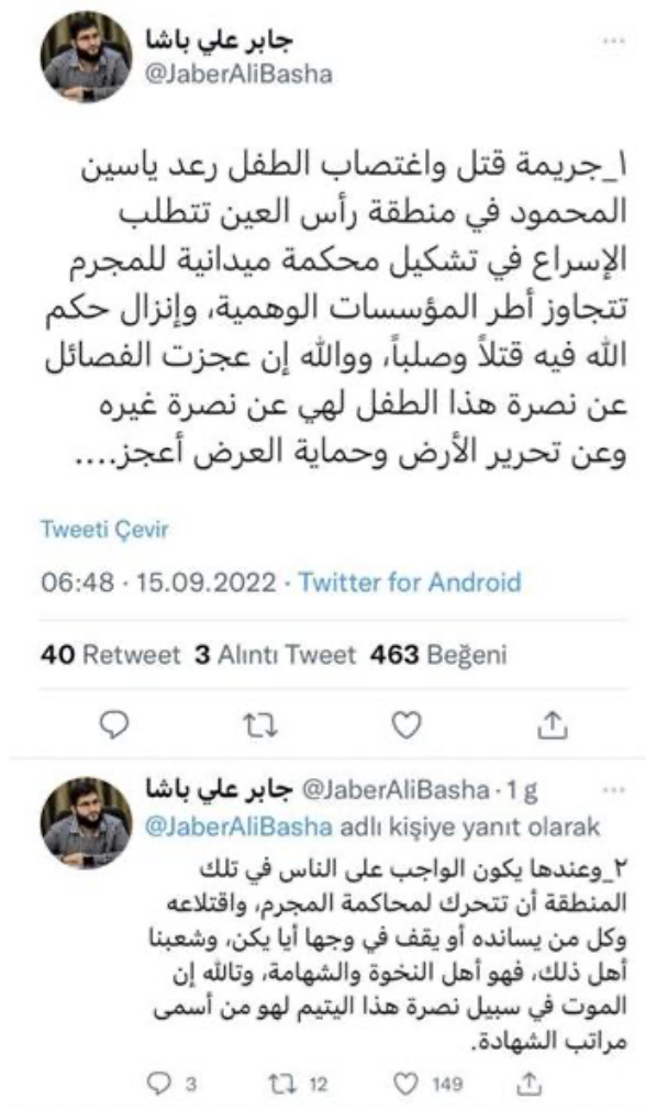
Image (4) - The tweet of Jaber Ali Basha, the former leader of the Ahrar al-Sham Islamic Movement. He demands that the suspect be killed by crucifixion, outside the "delusional framework" of institutions. ( Link to the original tweet, accessed on 08 November 2022).

Image (3) - The tweet of Abu Hatem Shaqra, the leader of the "Ahrar al-Sharqiya" and the deputy leader of the Liberation and Construction Movement. He admits that members of the National Army killed the suspect ( Link to the original tweet, accessed on 08 November 2022).