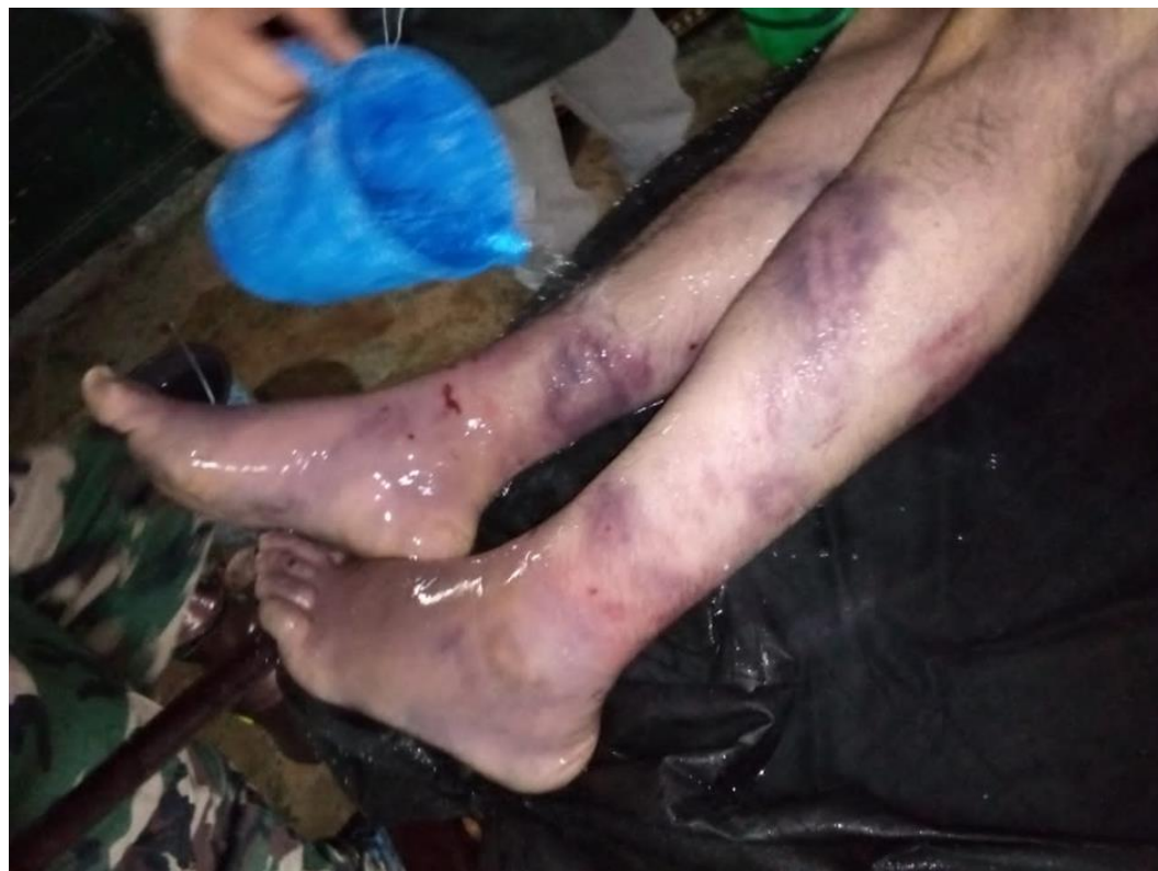
Image (5)- Dead body of the victim Abdulrazaq Trad al-Obaid al-Nuaimi, with torture marks on the feet.