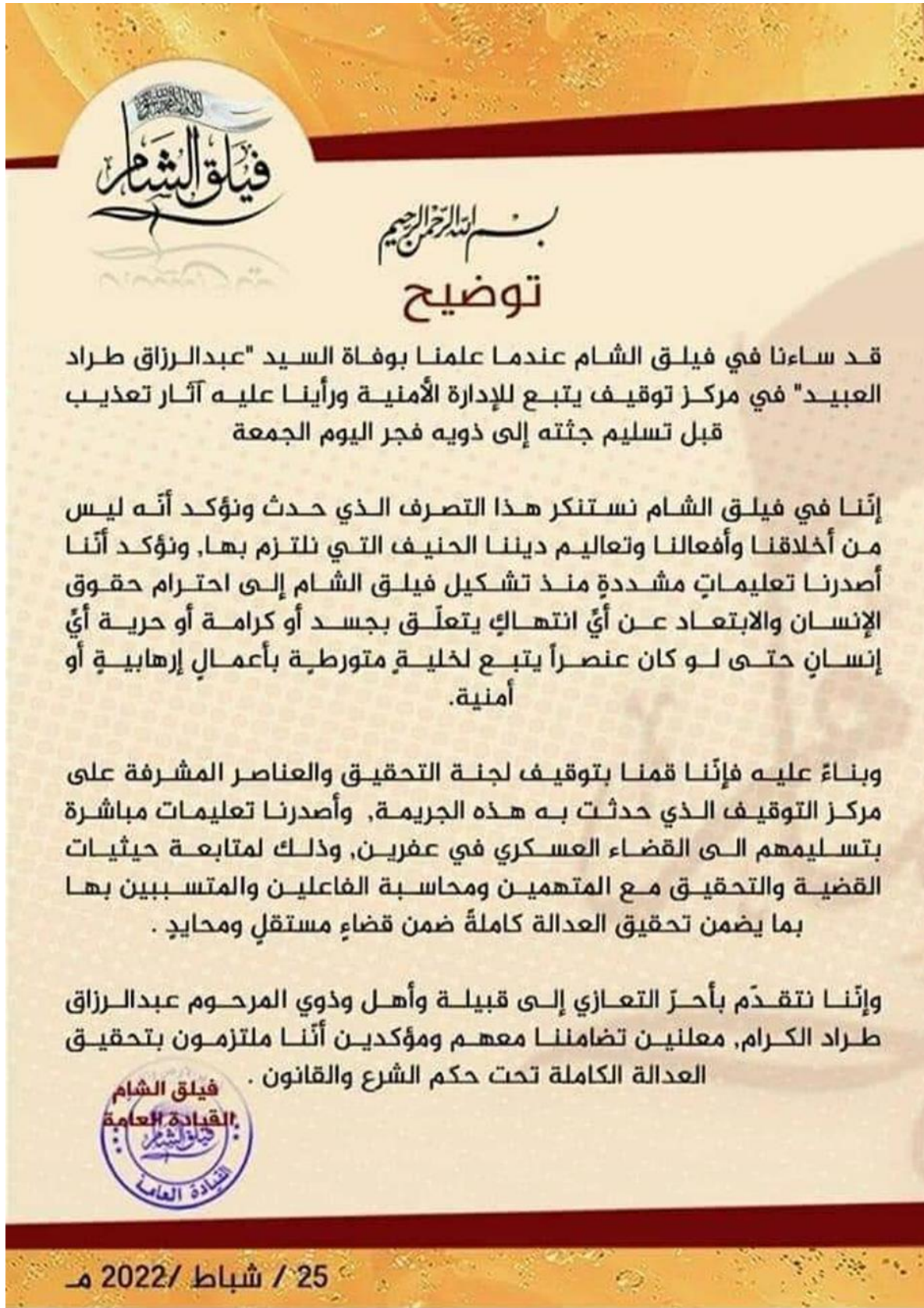
Image (6) - Copy of the statement published by the al-Sham Legion/Faylaq al-Sham following the death of Abdulrazaq Trad al-Obaid al-Nuaimi, saying that they had referred the perpetrators to judiciary.