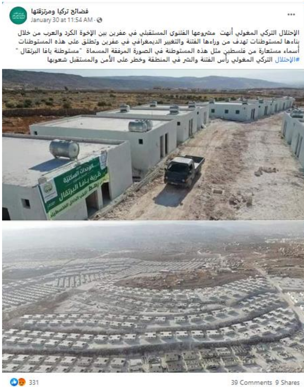
Image (1)- A Facebook photo post claims to show a new settlement constructed in Afrin by Turkey in the context of its demographic change plan.