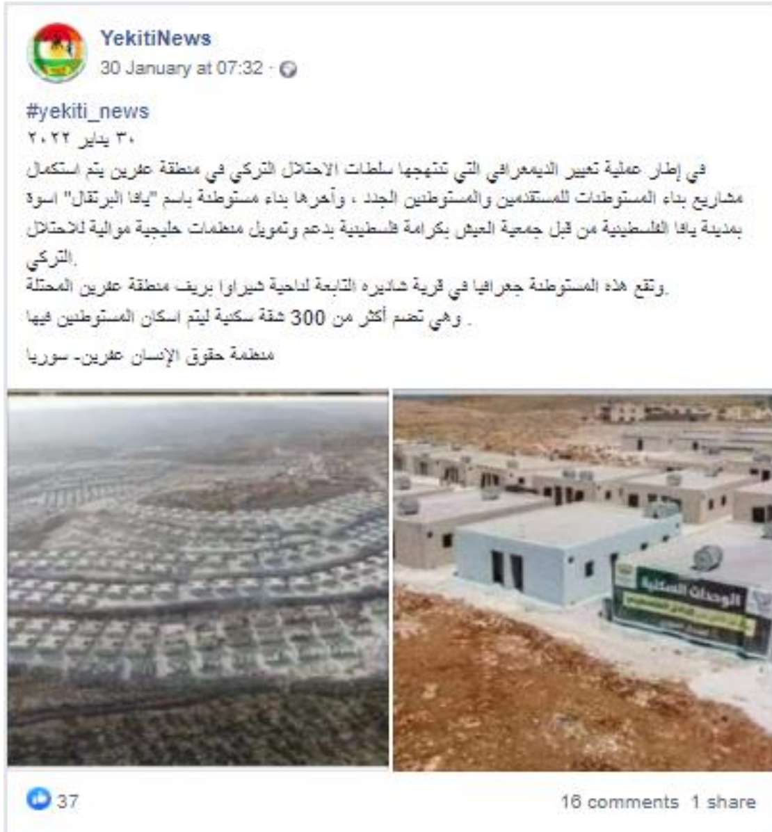
Image (2)- A Facebook photo post claims the Orange Jaffa village located in Afrin. The post tagged the Human Rights Organization -Afrin –Syria as a source, but STJ did not find a related post on the Organization's accounts on social media.