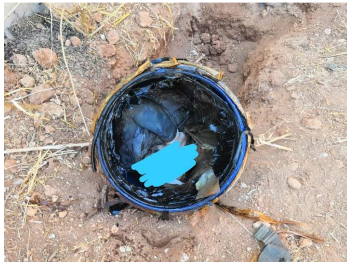
Image 1- The Civil Defense teams revealing the body of a dead woman dumped in a sealed barrel in al-Bab city.

On 12 August 2020, in al-Bab city, the northeastern countryside of Aleppo, the Civil Defense teams found the body of a woman in her twenties. The body was dumped in a sealed barrel on the road between al-Bab city and Qadiran village. The teams delivered the body to the al-Bab National Hospital. No additional details were available on the incident.