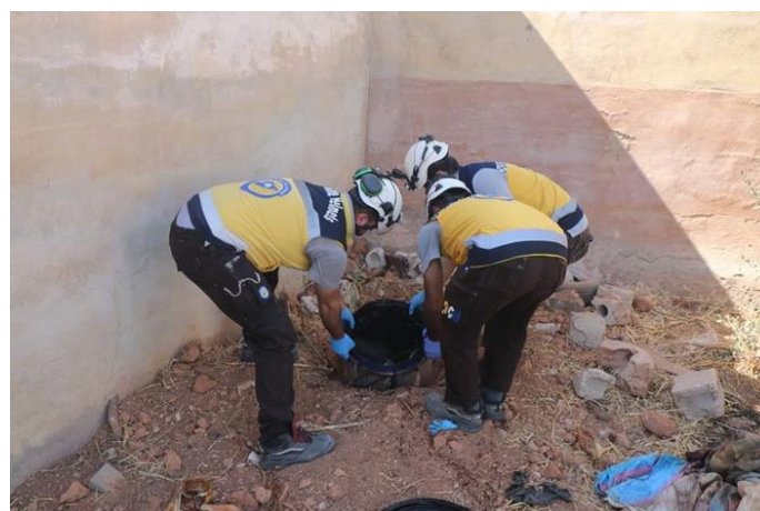
Image 2- The Civil Defense teams revealing the body of a dead woman dumped in a sealed barrel in al-Bab city.