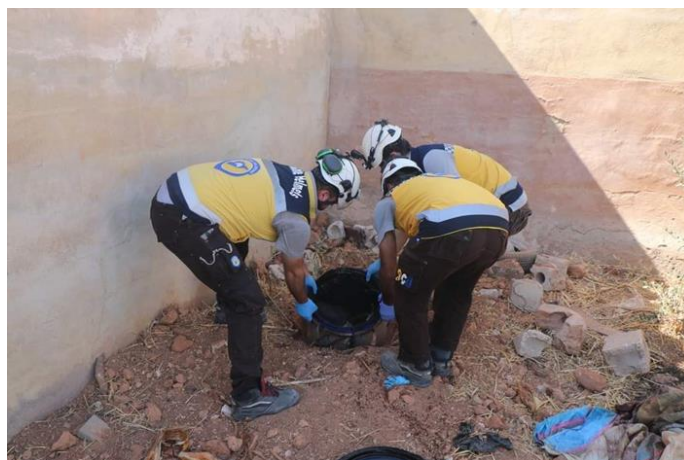
Image 2- The Civil Defense teams revealing the body of a dead woman dumped in a sealed barrel in al-Bab city.