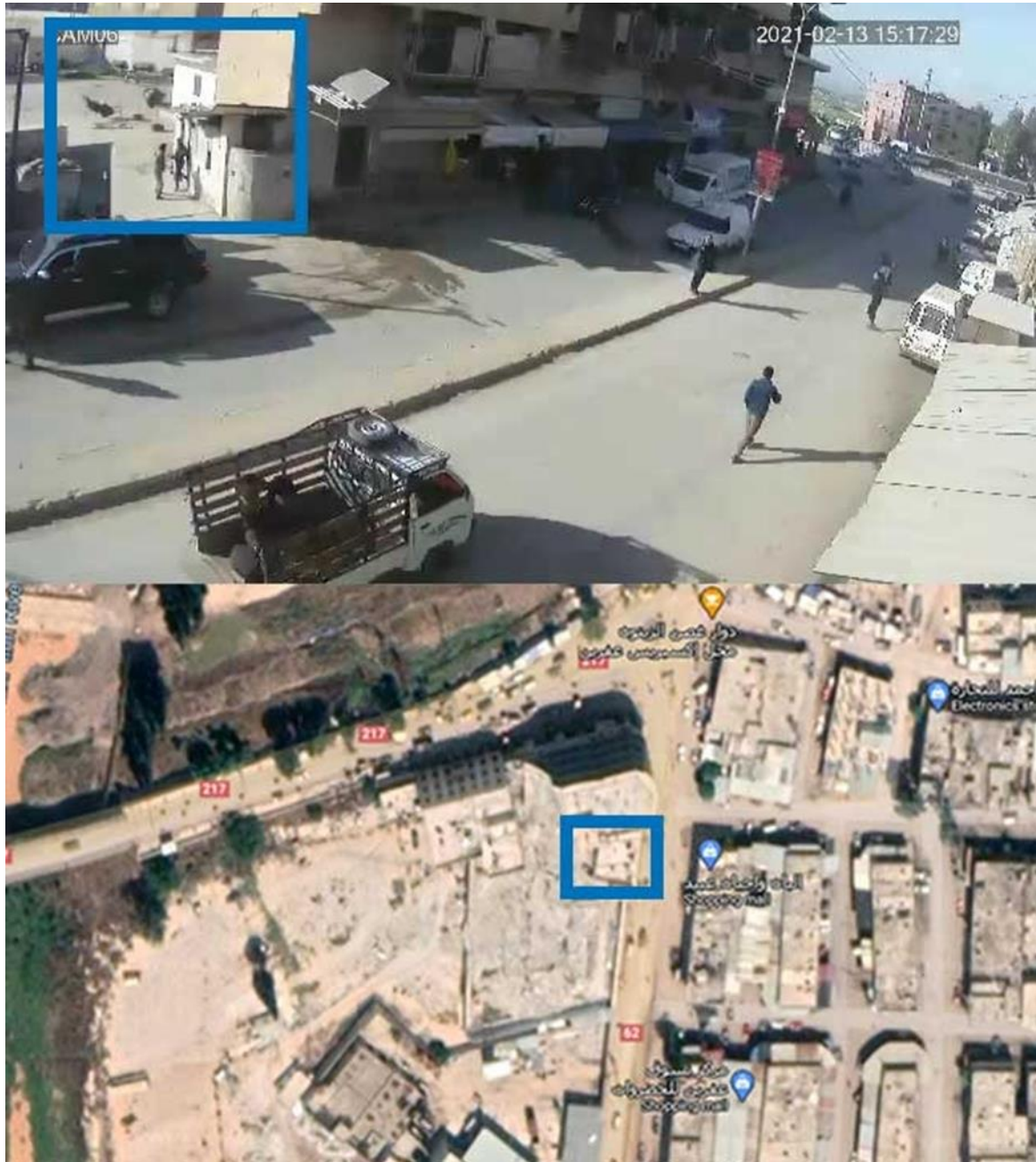
Image 1- Screenshot from the above-mentioned video, showing the black car of the al-Jabha al-Shamiya/Levant Front near the military headquarters of the Jaysh al-Islam/al-Islam Army, close to the Kawa Roundabout. The bottom section of the image, locates the headquarters at one of Afrin city's neighborhoods.

sum of money. When the Front's fighters tried to arrest him, the Army's fighters intervened, and the confrontation developed into a brutal armed clash. The smuggler managed to escape, eyewitnesses and local sources told STJ's field researcher.