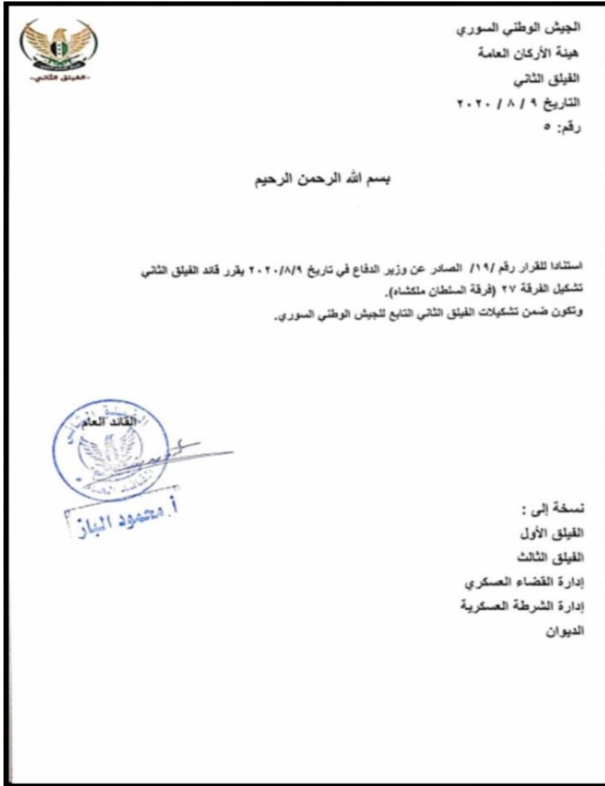
A copy of the decision to form Liwa Sultan Malik Shah Tümeni, “the 27th Division” of the opposition-affiliated Syrian National Army