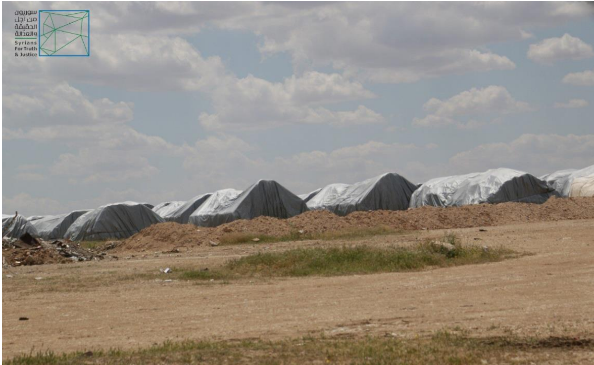
Picture No. (14) – shows piles of grain located near the Court Roundabout in Tell Abiad city on 8 May 2020, transported by Ahrar al-Sharqiya from one of the silos it seized and stored there.

STJ's field researcher in Tell Abiad city monitored the faction of the al-Jabha al-Shamia/Levant Front storing the grain they seized near the "court building" in addition to the grain silos at the border crossing, while the al-Majid Corps stored a portion of the grain at the Agricultural Bank's building and another portion at the Cement Corporation's warehouses.