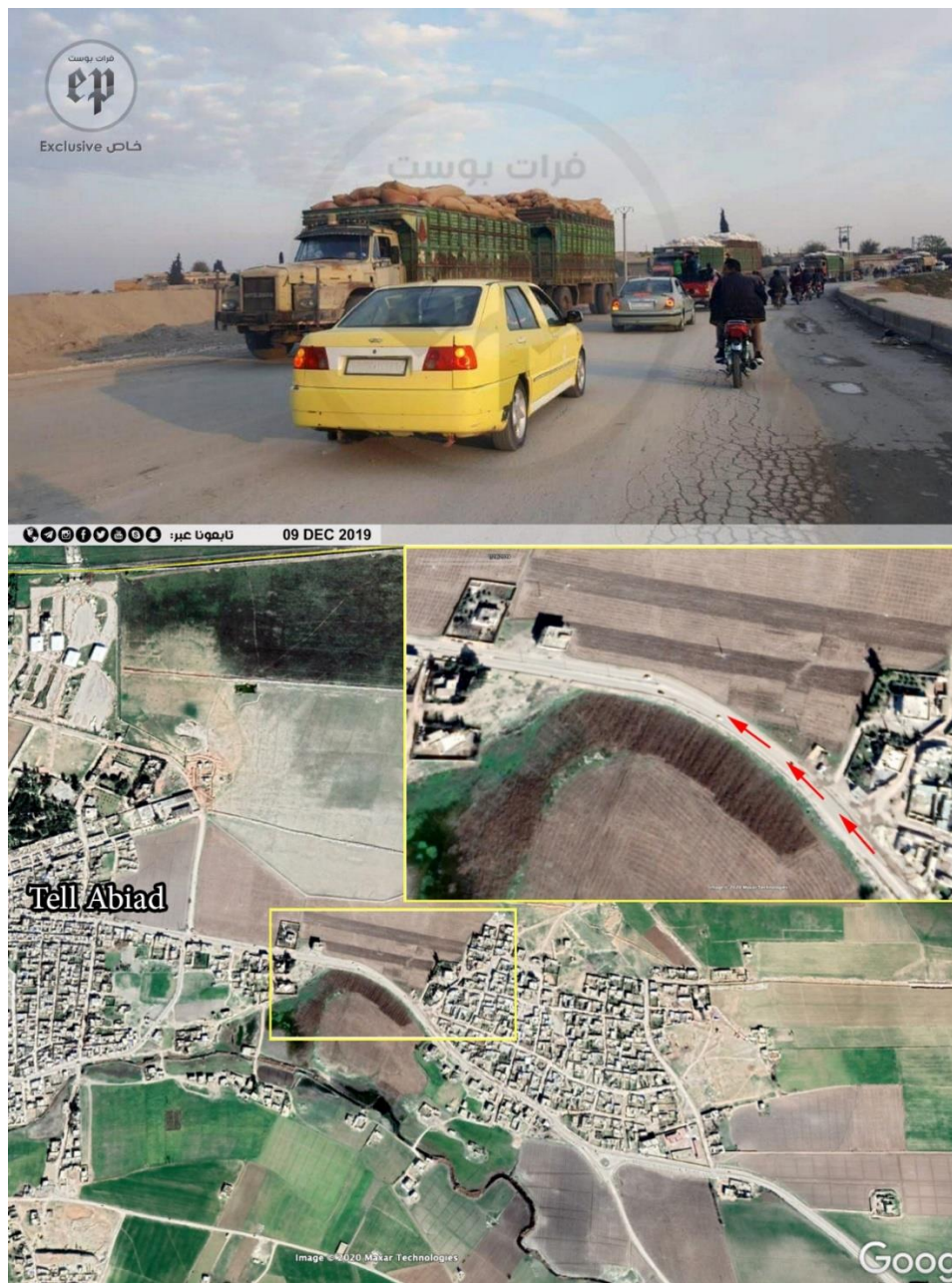
Photo No. (7) – The one at the top, published by EuphratesPost , shows a convoy of trucks loaded with grain on the Tell Abiad road , near the Turkish borders. Photo no. (8) – The one below locates the route taken by the convoy towards the Syrian city of Tell Abiad, near the Turkish borders. This are the road's coordinates: 36.696010, 38.967564.

On 9 December 2019, EuphratesPost , a news outlet, published a photo showing a convoy of trucks loaded with grain on the Tell Abiad road , apparently coming from Tell Abiad Silos.