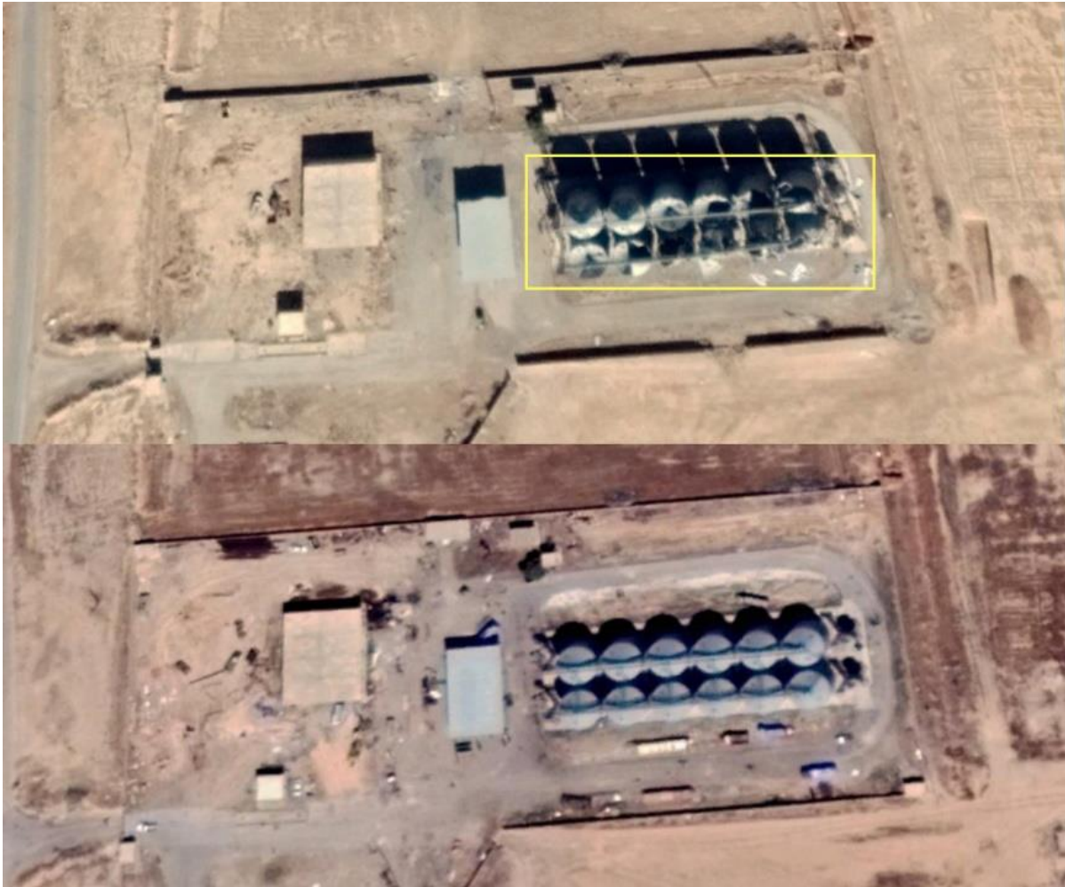
Photo no. (5) – The satellite image, on top, shows the destruction caused to the al-Rashid Grain Silos in Raqqa province, which is its current state. The one below, no. (6), is also a satellite image, however, taken on 15 February 2014.