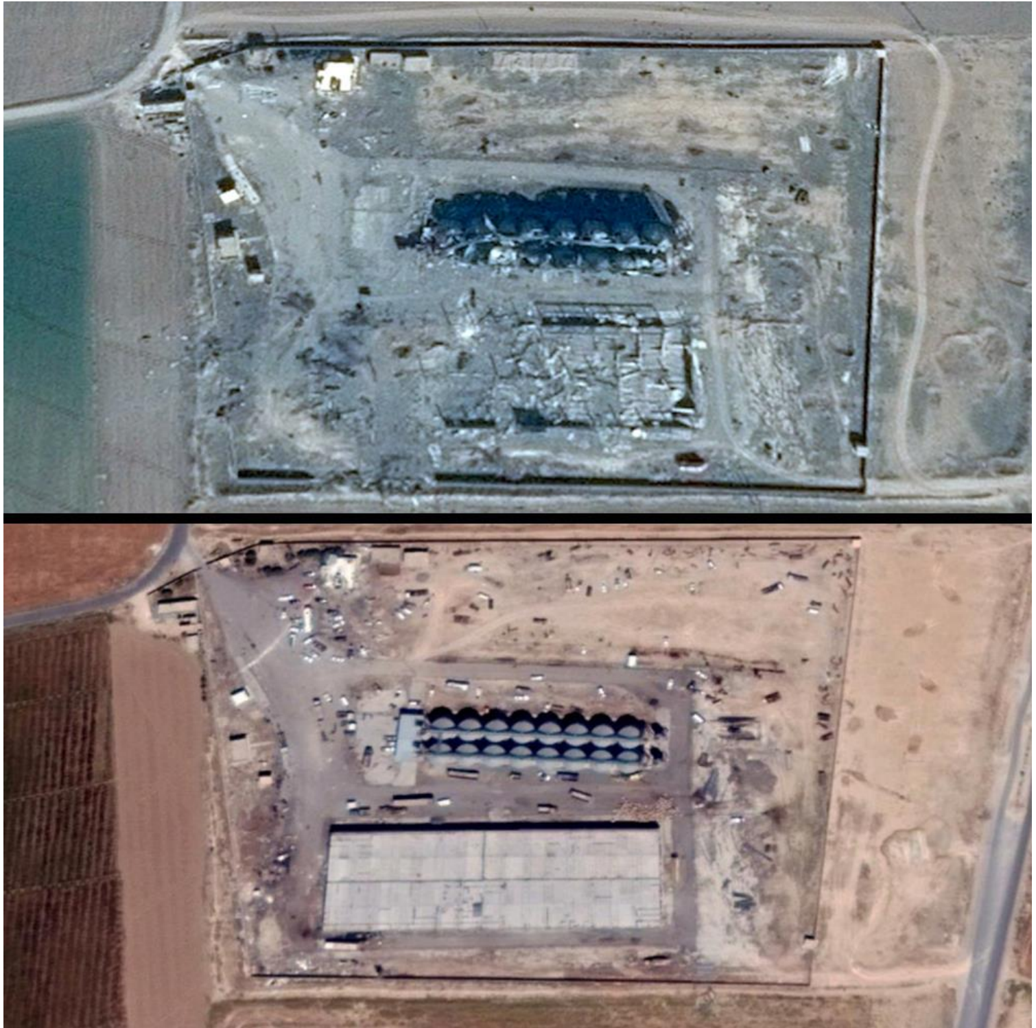
Photo no. (3) – The satellite image, on top, shows the destruction caused to the Slouk Grain Silos in Raqqa province, which is its current state. The one below, no. (4), is also a satellite image, however, taken on 15 February 2014.