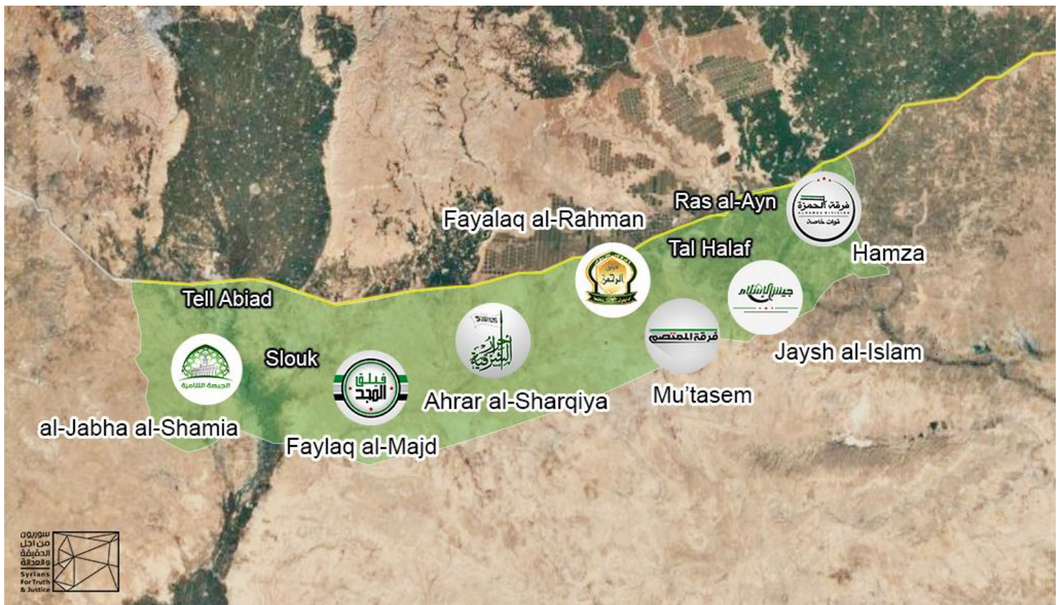
Photo no. (1) – Map locating the National Army’s posts in the region targeted by Operation Peace Spring .

Youssef al-Hamoud, spokesperson of the Syrian National Army, reported to local media outlets that one of the agreement’s terms provided for the spread of Syrian Regular Forces and their Russian counterparts south of the M4 highway, while The Turkish forces, along with the National Army’s factions are to take positions north the highway, which is to be supervised by joint Russian-Turkish patrols. The spokesperson also pointed out that Russia has already embarked on setting up a military base within the Aliyah silos’ area, located on the southern part of the M4. 5