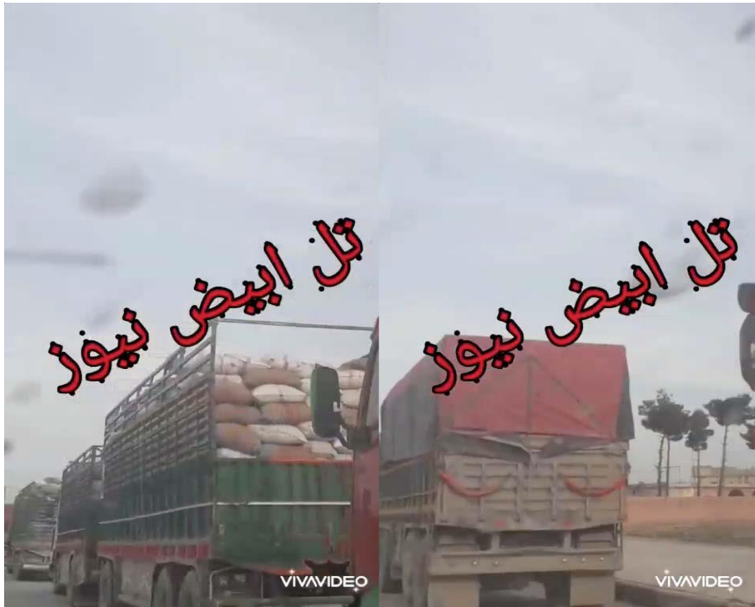
Photo No. (15) - A photo posted by the Tell Abiad News channel on the Telegram, captioned as trucks of the al-Snabile Company of the Levant Front, transporting grain on Tell Abiad road.