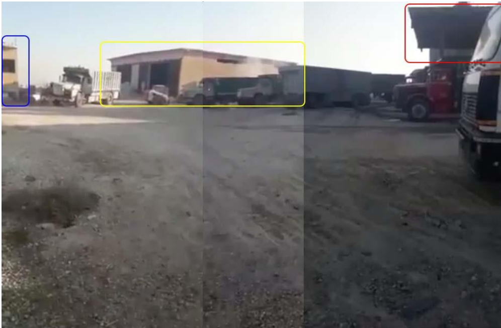
Photo no. (9) – A merged photo taken from a video posted by the Rojava Activists Network on 11 December 2019, where a number of trucks appear, captioned as parked at one of Tell Abiad’s warehouses.

Moreover, the video does not clearly display whether the process being carried out is loading or unloading of the grain stocks, neither its direction, whether from or to the silos. However, it confirms the transportation of grain and the large number of trucks assigned for this purpose.