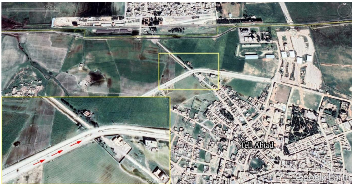
Photo No. (16) - A satellite image shows the road taken by the trucks referred to in photo 13, near the silos of Tell Abiad at the Syrian-Turkish border.