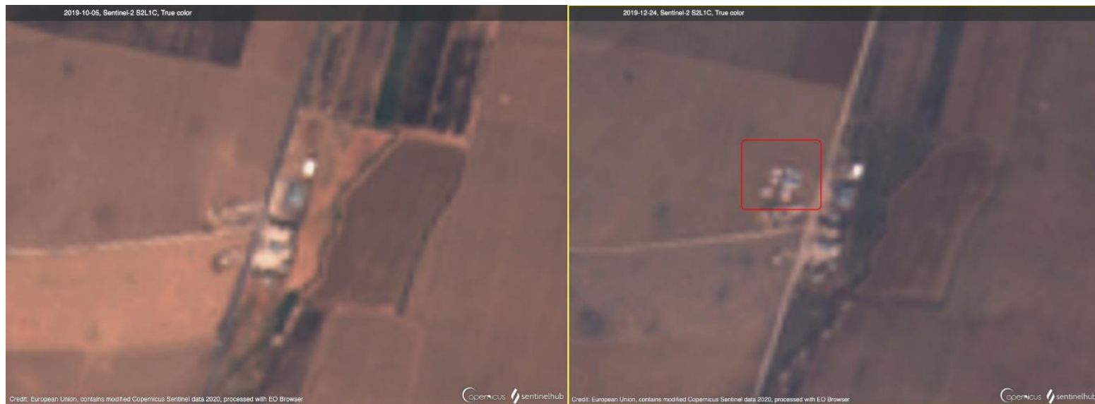
Photo No. (11) - Satellites image taken on 20 December, 2019, showing a pile of grain near the al-Abbas Gas Station in the Farajah village, rural Tell Abiad, the site referred to by the Rojava activists network .

STJ tracked the storage sites reported by Rojava Activists Network , and satellite imagery showed that these quantities do exist at the mentioned location.