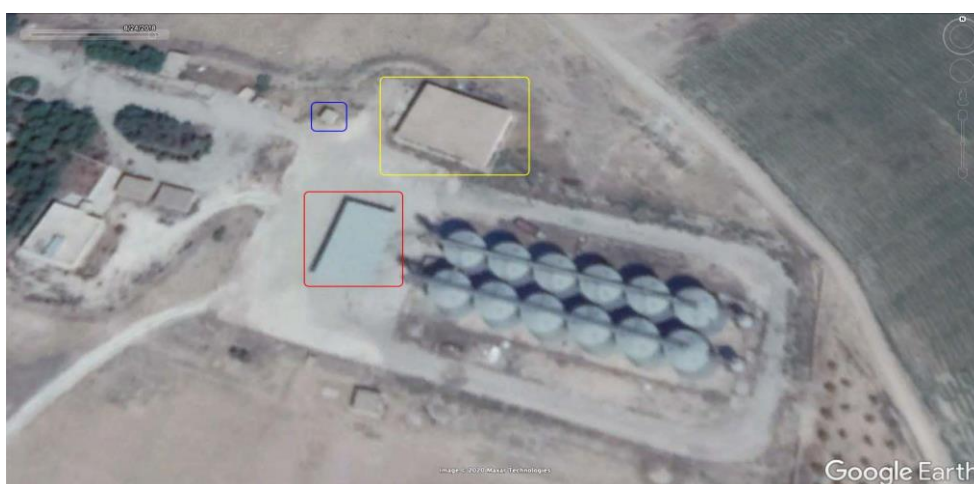
Photo No. (10) - Satellite image showing the precise location of the previous photo and video published by Rojava Activists Network , where the video was filmed, namely at Tal Halef silos near Ras al-Ayn/Serê Kaniyê.