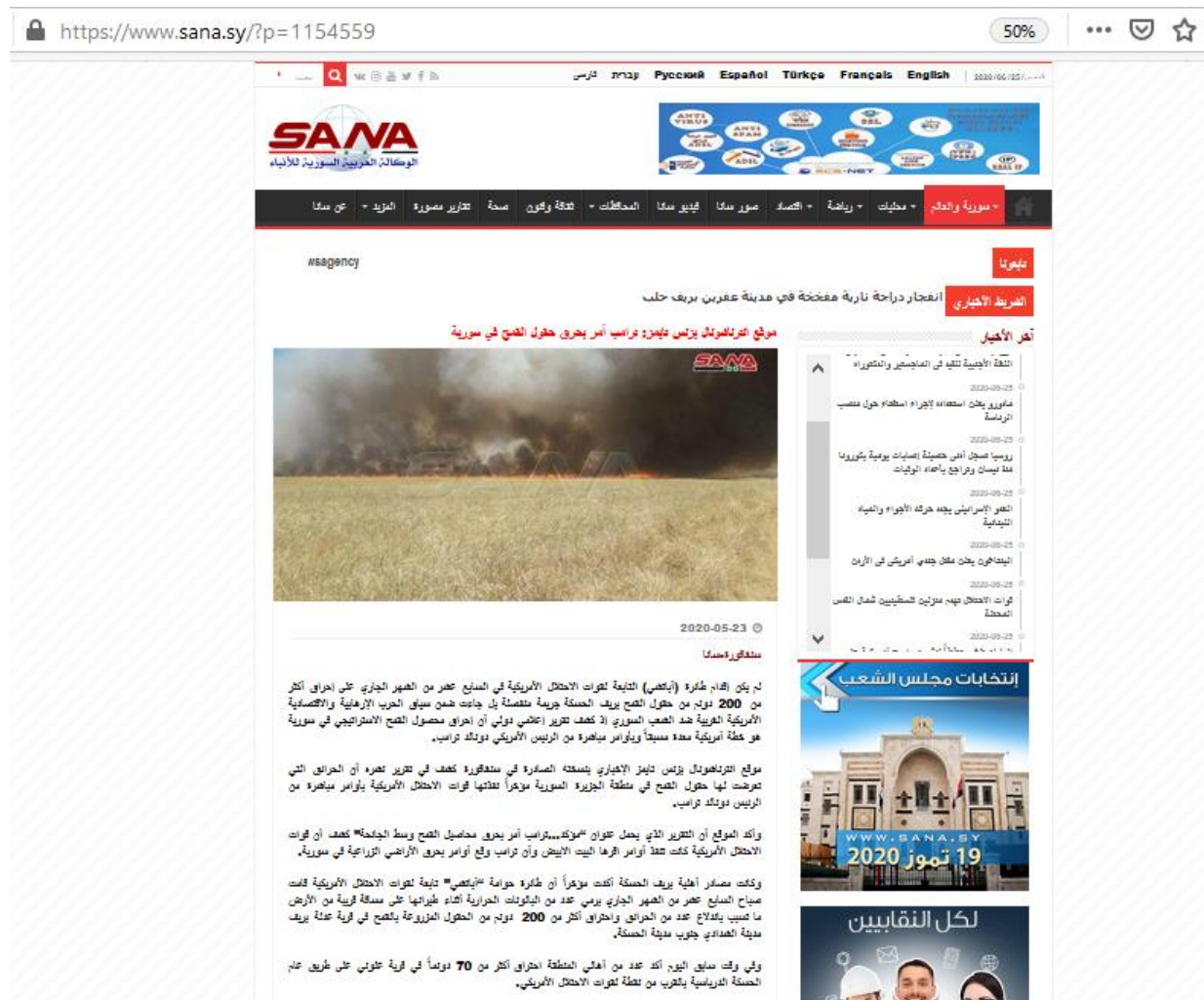
Photo no. (1) – Taken from SANA, which published a report on 23 May 2020, citing International Business Time , claiming that US forces set fire to wheat and barley fields in the region of al-Jazira/Hasaka province, under President Donald Trump's orders.

Arab and international media outlets, including Sky News Arabia and Sputnik News Agency , reported the same incident and referenced International Business Times as well. Published on 23 May 2020, Sputnik's report added that on the evening of 22 May 2020, 2 two US Apache helicopters dropped a number of thermal balloons while flying close to the ground over five villages extending between the towns of Tell Barak and al-Hawl , southeast Hasaka, setting over 250 hectares of cultivated agriculture land on fire, destroying, thus, wheat and barley crops ready for harvest.