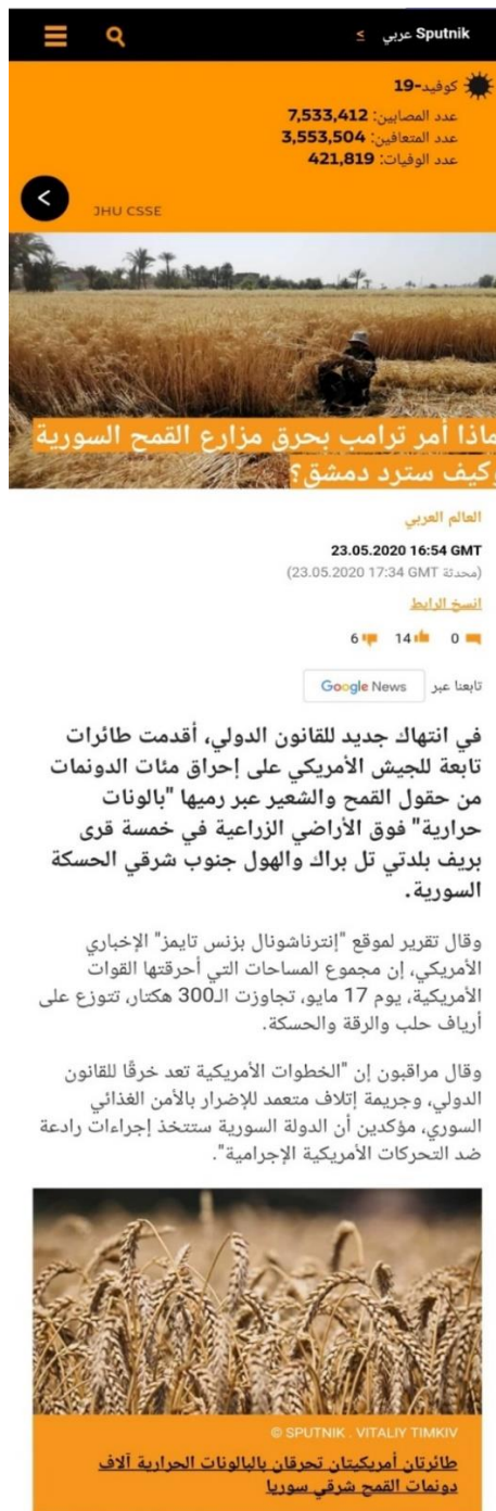
Photo no. (3)- Taken from Sputnik News Agency, which published a report , titled: "Why did Trump order Syrian wheat crop be burned and how would Damascus retaliate?", on 23 May 2020, saying that US helicopters set fire to hundreds of hectares of wheat and barley fields in five villages in the towns of Tell Barak and al-Hawl, southeastern Hasaka.

Syrians for Truth and Justice / STJ tracked evidence provided by open sources and interviewed witnesses from the areas where wheat and barley crops were burned in rural al-Shaddadi and the villages located between the towns of Tell Brak and al-Hawl , concluding that the claims that the US forces have perpetuated those fires are groundless.