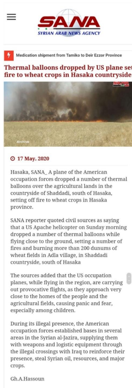
Photo no. (4) –Taken from SANA-English, which posted a report on 17 May 2020, titled: “Thermal balloons dropped by US plane set fire to wheat crops in Hasaka countryside,” claiming that US forces have set on fire over 20 hectares of agricultural land cultivated with Wheat in Adla Village, rural al-Shadadi city, south of Hasaka city.

At the end of the process of investigation and verification, it became clear that International Business Times , which SANA and other media outlets have referenced as a source for their reports, accusing US forces of burning wheat and barley crops in al-Jazira region / the Syrian province of Hasaka, has itself based its news on a report originally published by SANA on 17 May 2020. 4