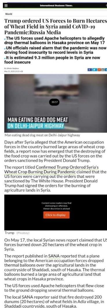
Photo no. (5) –Taken from International Business Times , which published a report on 21 May 2020, titled: “Trump ordered US Forces to Burn Hectares of Wheat Field in Syria amid CoVID-19 Pandemic: Russia Media.” 5 In the report, the outlet, quoting SANA, claimed that US forces have set wheat fields ablaze in Syrian Hasaka province commanded by President Donald Trump.

While none of these media outlets provided evidence that President Donald Trump has commanded the burning of the crops, no comment was made by any US official on these accusations.