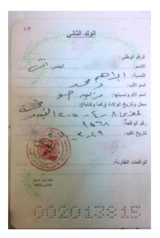
Picture No. (9): shows the personal details of the minor girl Aisha Mohammad Ibrahim, which are included in the family register, indicating that she was born in 2005.