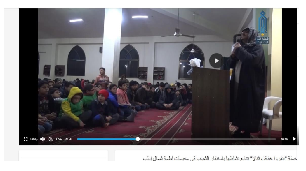
Photo (13): taken from the <u>above-mentioned video</u>, it shows a number of children, recruited under the HTS-launched "Infiro Khifafan wa-Thikalan/Go forth, whether Light and Heavy".

Another video, posted by Ibaa in January 2020,<sup>8</sup> shows an event under HTS' campaign "Infiro Khifafan wa-Thikalan/Go forth, whether Light or Heavy", during which a number of children were enlisted.