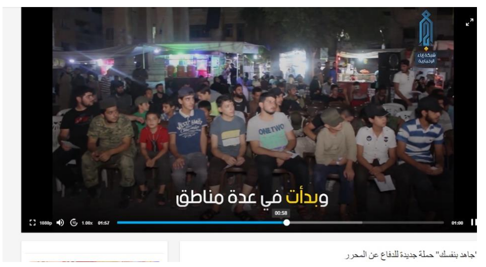
Photo (12): taken from the <u>above-mentioned video</u>, it shows one of the events held under the HTS-launched "Jahid be-Nafsak/Invest Yourself in the Strife" Campaign.

In this regard, a video posted by Ibaa News Agency , known for its affiliation to HTS, captures one event within the "Jahid be-Nafsak/Invest Yourself in the Strife" campaign in September 2019, which HTS organized to attract recruits. The video clearly shows that among the attendees were several children.