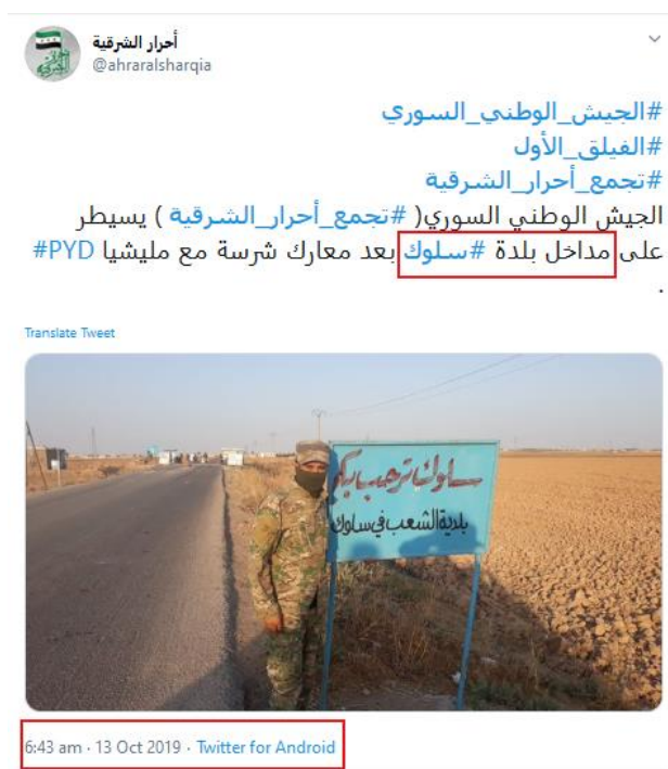
Image (4) a tweet published by Ahrar al-Sharqiya on October 13, 2019, declaring control of the entrance to the town of Suluk in Raqqa.

On October 13, 2019, exactly at 6:43 AM, Ahrar al-Sharqiya published a tweet on its Twitter official account , saying that it had taken control of the entrance to the town of Suluk and attached the tweet with a photo of a masked fighter standing in front of a road sign saying "Welcome to Suluk".