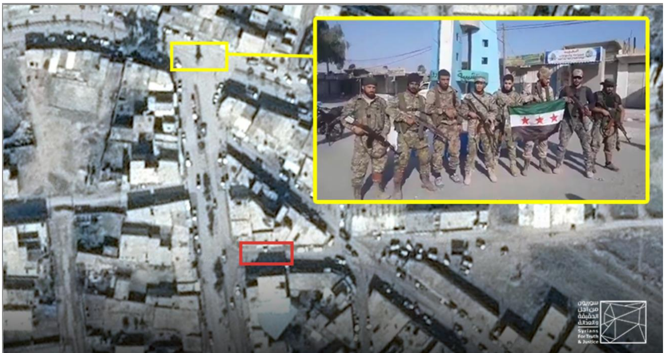
Image (9) the distance between the hospital and the location of Ahrar al-Sharqiya fighters when declaring control of the town.