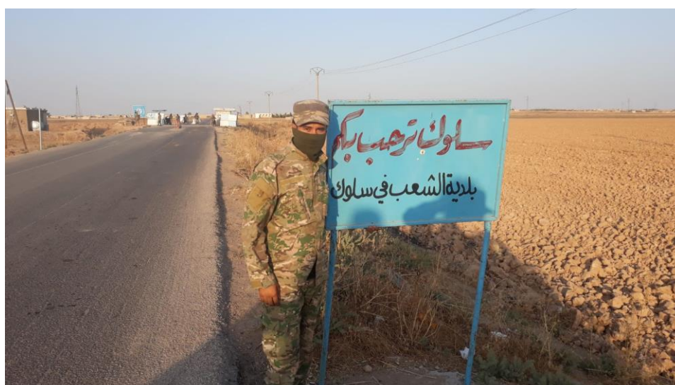
Image (5) a photo of a fighter attached to the abovementioned tweet.