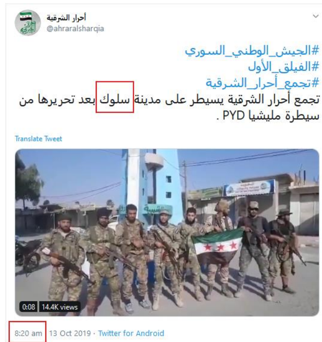
Image (6) a tweet published on the official Twitter account of Ahrar al-Sharqiya group, declaring full control of Suluk, in Raqqa. Oct. 13, 2019.

On the same day, at 8:20 in the morning, Ahrar al-Sharqiya posted an 11-second footage , in which eight of its fighters appeared lining up at the main roundabout in the town of Suluk, carrying light weapons, and declaring full control of the town.