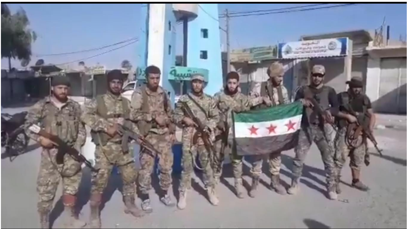
Image (7) the eight fighters appeared in the abovementioned footage.