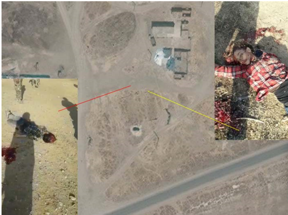
Image (7) a satellite image shows where the bodies of the two fighters were found.