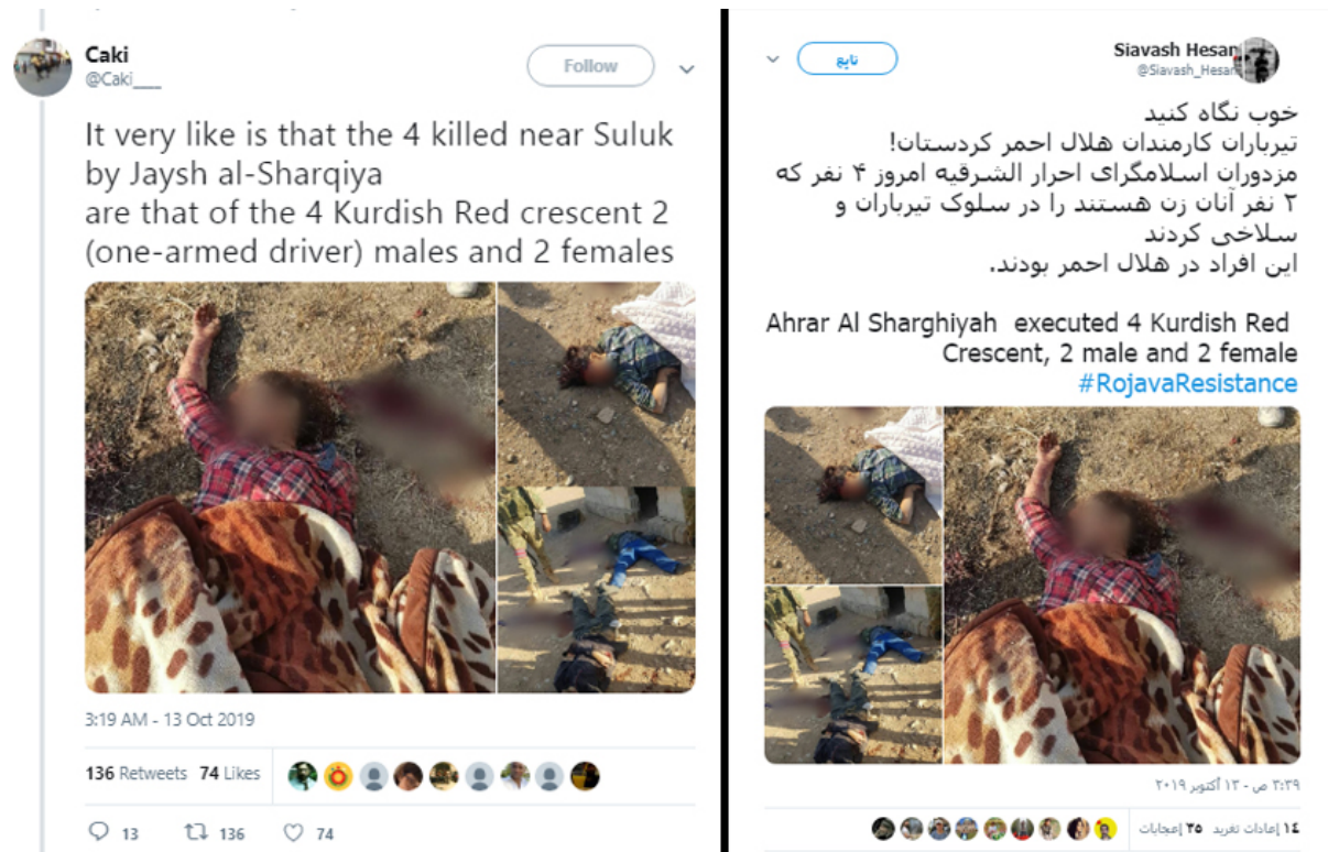
Image (1-2) posts on Twitter saying that the bodies belong to female Kurdish Red Crescent volunteers.

Turning to the incident of our interest, the photos and footages relate to it, were first published on a Telegram channel named Alkabous_Jarablous, which had been closed several times. After that, they were spread on social media and mostly on Twitter.