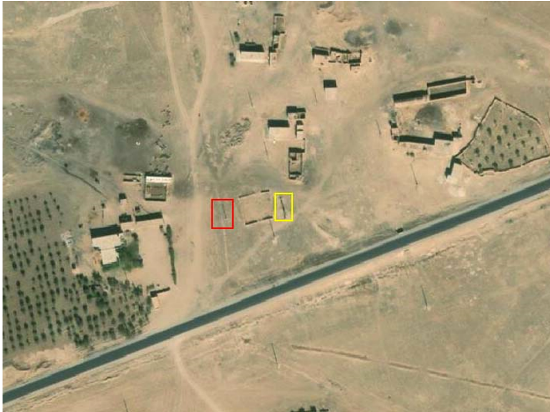
Image (6) a satellite image shows the location of the incident; the yellow and red squares mark the location of the bodies of the two fighters.