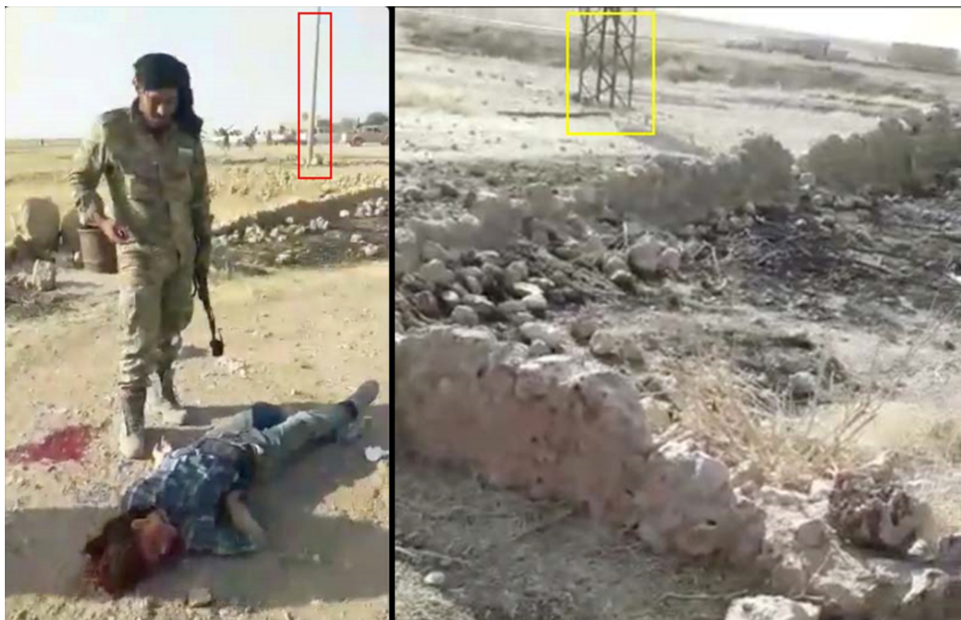
Image (8-9) the body of one of the fighters, with a male fighter standing near it holding a weapon.