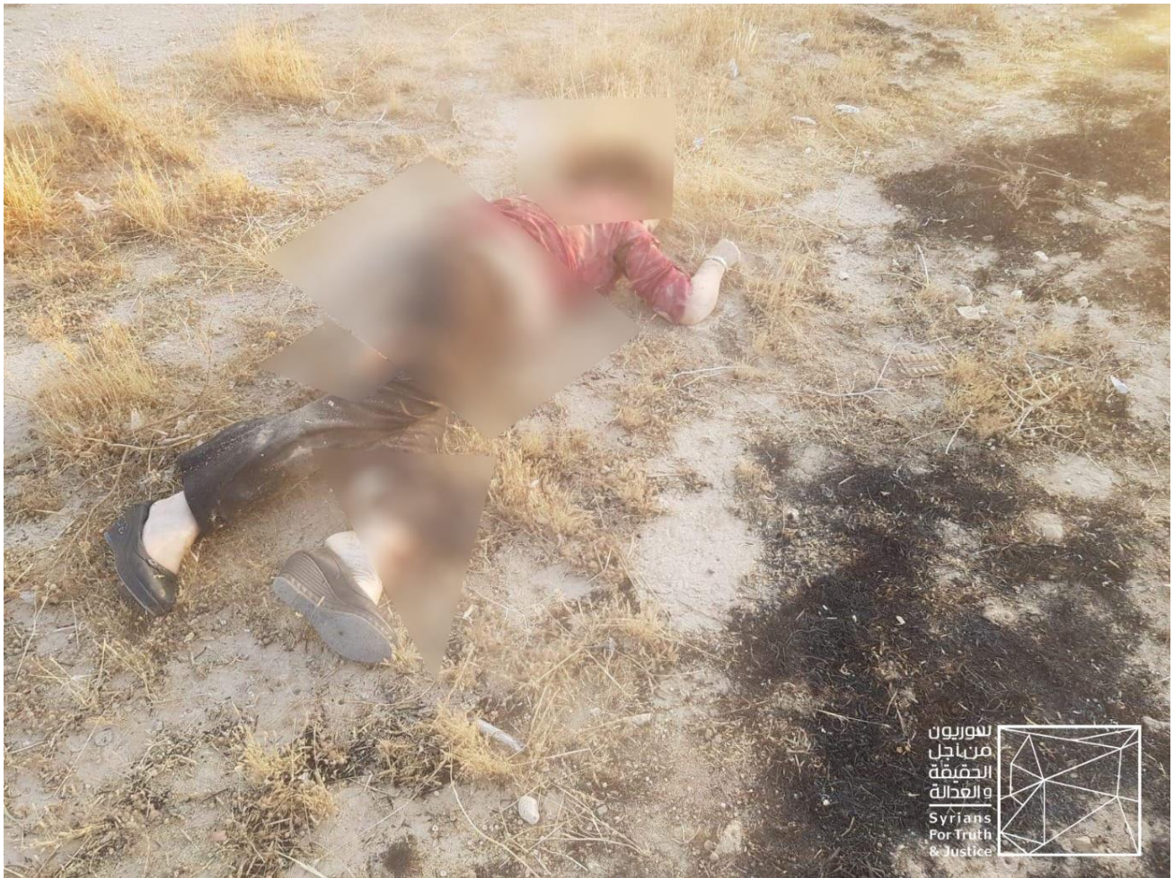
The Kurdish politician, Hevrin Khalaf, immediately after she was killed by Ahrar al-Sharqiya armed Syrian rebel group.