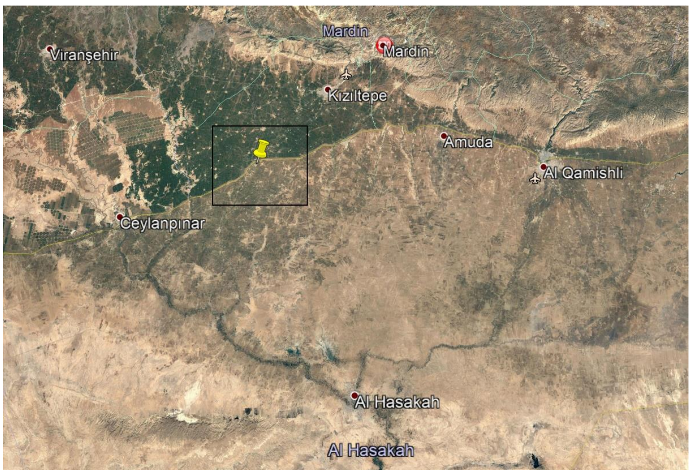
A satellite image illustrates the scene of the attack at the Syria–Turkey barrier.

According to the witness, the smuggler denied the whole thing when questioned by the Asayish forces. Her family, however, filed a suit against him and he was subsequently imprisoned.