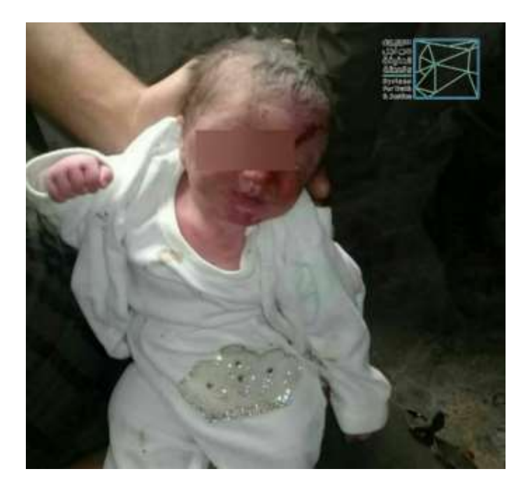
The dire conditions in which the baby was abandoned and the critical situation it was in.

"The baby's face was covered with blood, so I rushed it to the nearest medical point, where it got cleaned up and then transferred to Al-Hilal al-Azraq hospital at Bab al-Salam border crossing to be checked and placed in an incubator, waiting for the police to initiate an investigation into its case in a try to find its real parents. But, however, it was all pointless and a displaced family from Homs fostered it."