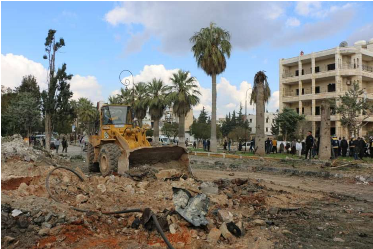
The patching of a pothole caused by the first car bomb in al-Qusour Street, Idlib city. Taken on: February 18, 2019.

STJ's field researcher reported that the al-Qusour Street contains offices of the following civil society organizations: Rakeen for Orphans Care Organization, Homs IDPs Department, Glimpse of Hope Center, Private Civil al-Fath School /al-Fateh al-Ahliyah al-Khasah, One Nation for Orphans/Umah Wahidah School, Narenj Tree Foundation and Care Center for Persons with Hearing and Speech Impairments , in addition to the building, near which the explosion took place, that incubates a gun shop, the first post of Uzbek fighters and the former Idlib Province Swimming Pool, which became the Uzbek militant's second military post. It is worth mentioning that al-Qusour street is considered the concentration place for the majority of Uzbek militants.