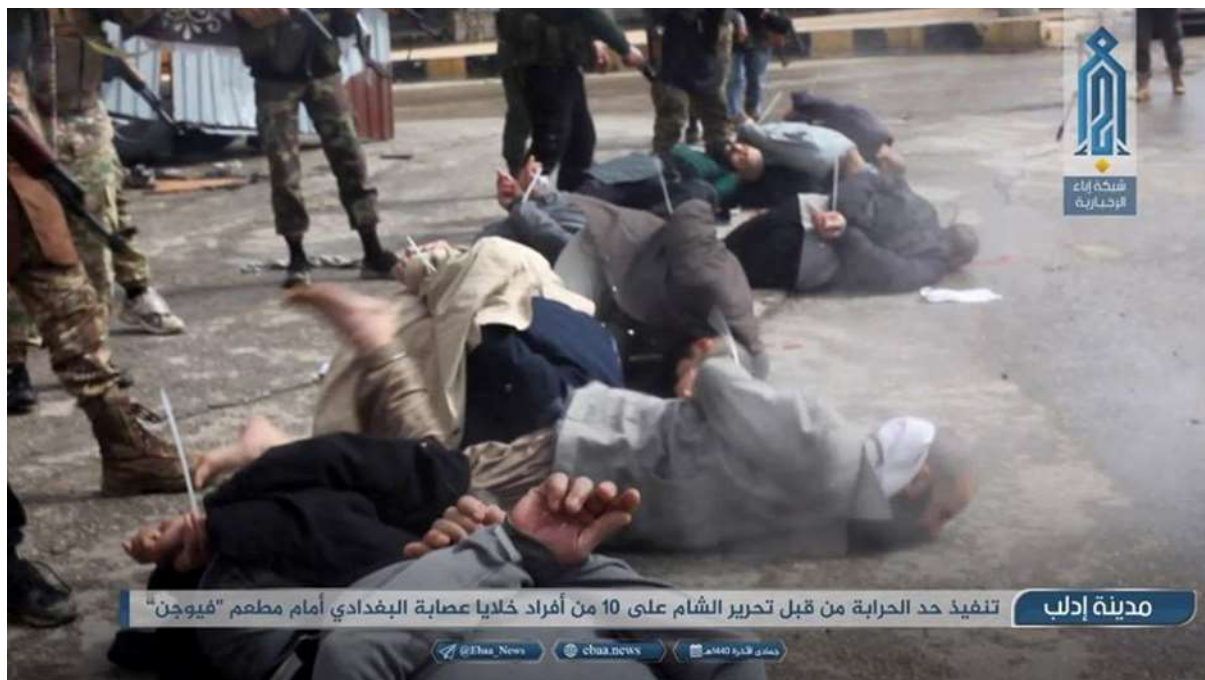
The executions carried out by HTS against the background of Fusion Restaurant's explosion in Idlib city.