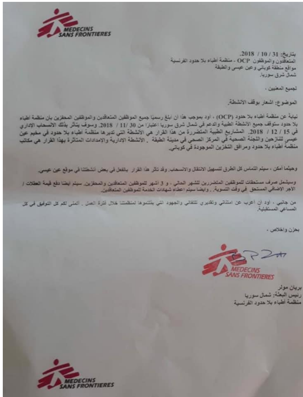
A photo of the notice issued by the MSF Head of Mission in Northern Syria, Brian Moller, on October 31, 2018, concerning the cession of all its medical activities and the support it provides in the area.

In a former report, STJ covered the severely deteriorating humanitarian conditions in the Ain Issa Camp, which resulted from the lack of basic services necessary to the displaced, such as shortage of food materials and the exacerbating medical status. 4