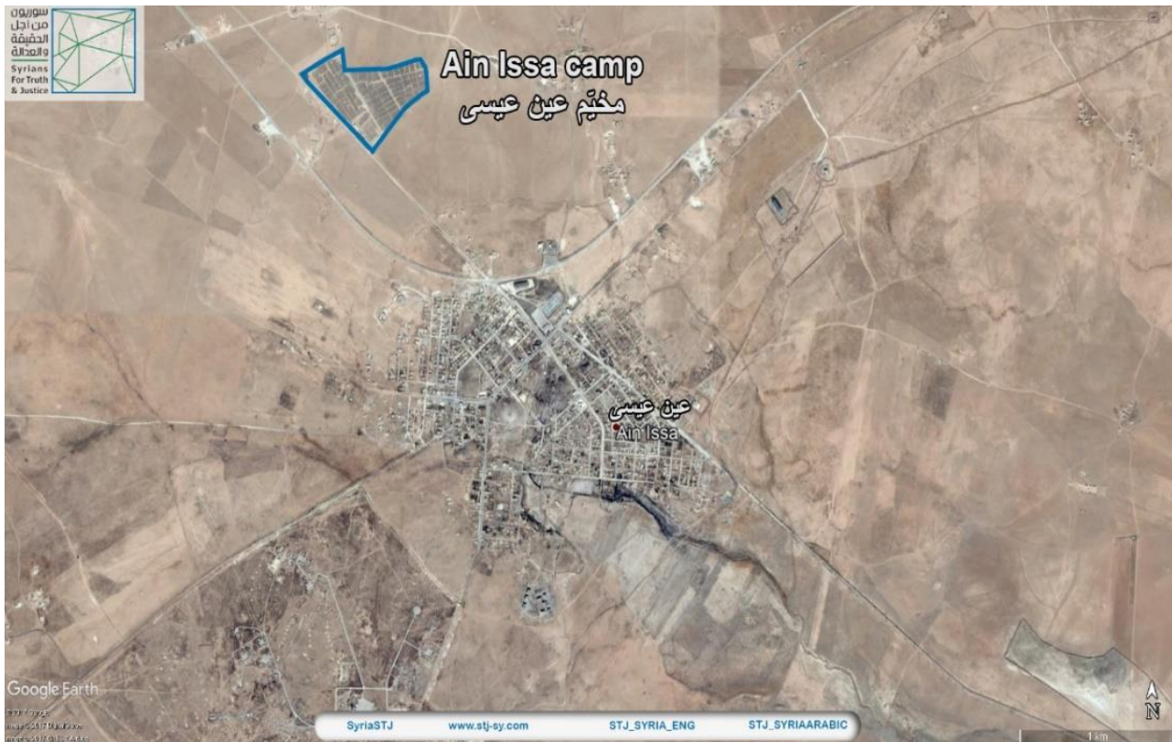
Ain Issa Camp's location – Raqqa

In the Ain Issa Camp, 12.000 Syrian internally displaced persons, of whom 5.000 are children, in addition to 500 Iraqi refugees, constitute the group most affected by MSF's decision to halt all its medical activities and the support it offers in Northeast Syria, according to several testimonies obtained by STJ in late November 2018.