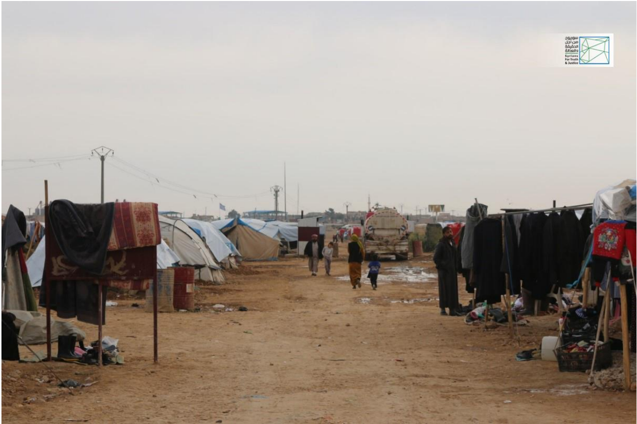
Photos of Ain Issa Camp. Taken on November 19, 2019.