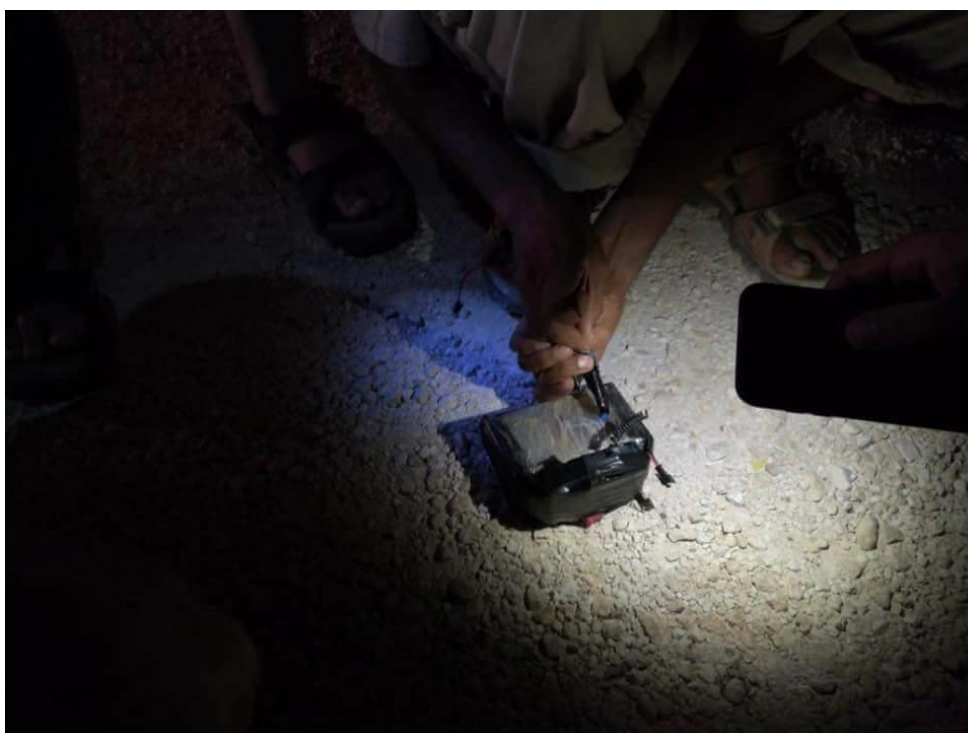
An image shows a part of the dismantle process of an IED that was put under a car within the city on May 22, 2018.