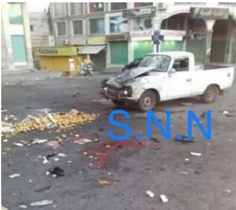
Image posted by Swaida News Network on July 25, 2018, showing signs of blood and a damaged vehicle following the explosion that targeted the vegetable market in al-Sweida.

In turn, Swaida News Network posted a video footage showing a hanged man around whom gathered lots of people, it said to be a suicide bomber, an element of ISIS, who attempted to blow himself up with the suicide vest in front of the National Hospital. STJ could not verify the identity of the hanged person yet.