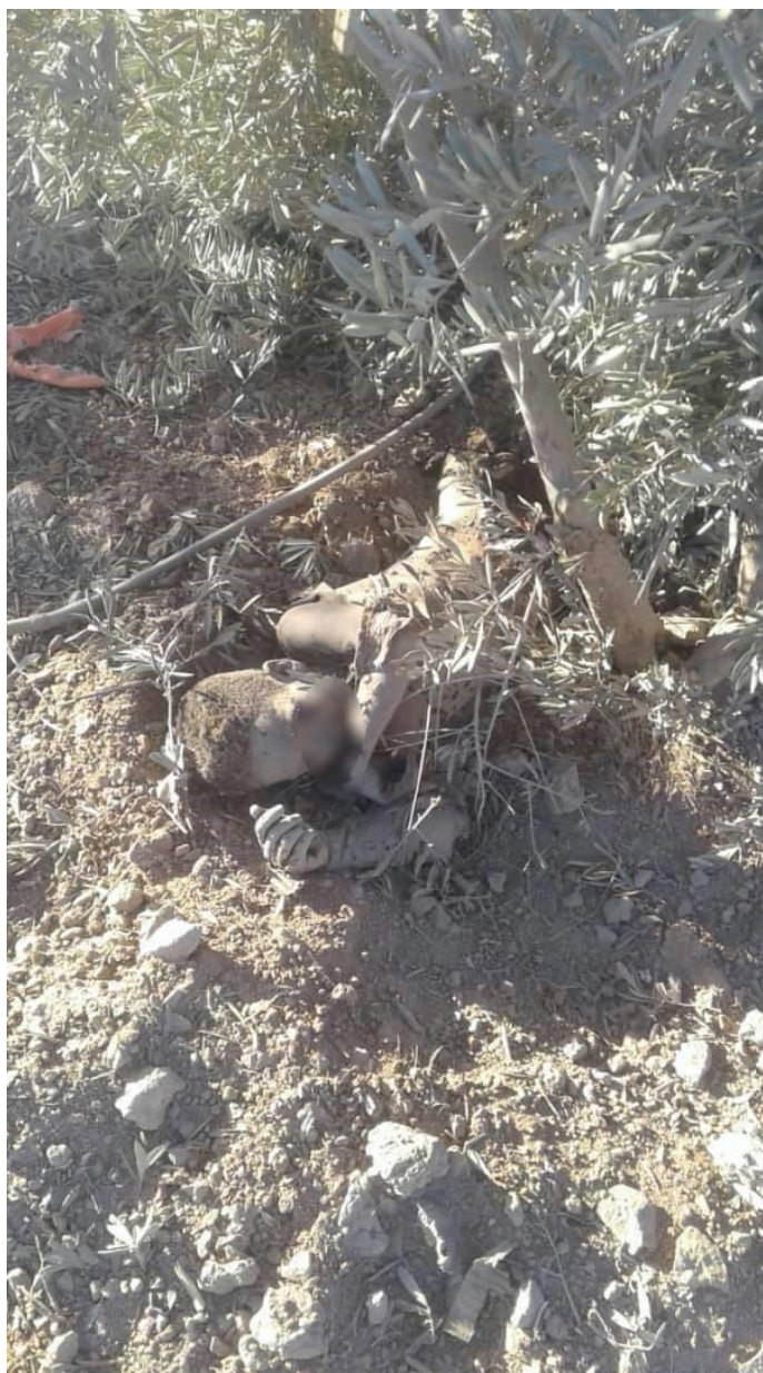
Image of a child victims of the airstrikes on al-Taebah town on June 27, 2018.