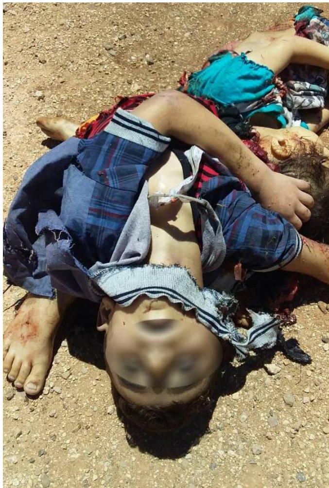
Image shows unidentified children victims who have been killed in the brutal aerial bombardment on al-Gharyah al-Sharqiya town on June 27, 2018.

"Shelling towns and cities of Seida, Meseifra and al-Jiza caused several field hospitals to be out of service, since they were targeted by Syrian/Russian warplanes. The Civil Defense Centre in Meseifra also went out of service after exposure to airstrikes. the number of displaced people who came from the eastern countryside of Daraa amounted to more than 150, 000 civilians who all headed to the border villages with Jordan, but the Syrian regime shelling began to access to these villages as well, forcing civilians to scatter in the plains close to the border with Jordan, which in turn blocked the Syrians fleeing the bombardment from entering its territory. Furthermore, the regime forces had prevented civilians from entering al-Sweida province or Damascus. It is worth mentioning that the latter is currently advancing towards the cities of al-Harak and Busr al-sham located near the Jordanian border, thus warns against a major humanitarian catastrophe."