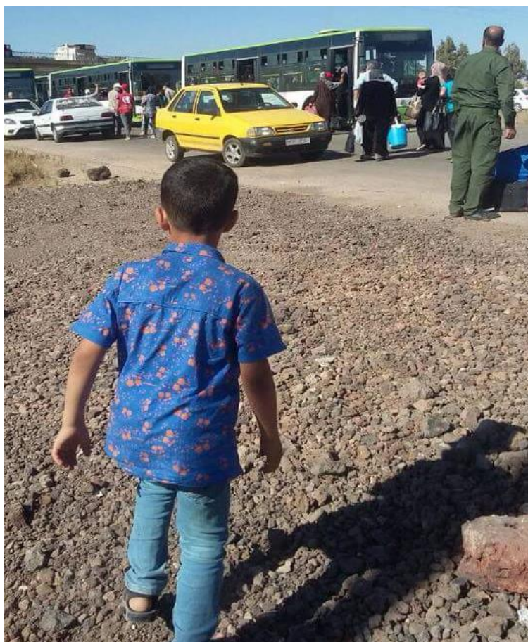
Image shows a part of the civilian gatherings in Dael town crossing located in Daraa countryside in order to proceed to the makeshift accommodation centers established by the Syrian regular forces on June 27, 2018.

Alternatively, the field researcher of STJ pointed out that up to 700 families from Daraa countryside had arrived to the accommodation centre near Jbab , and no further details of their current situation were received because of the heavy security intensification in the area.