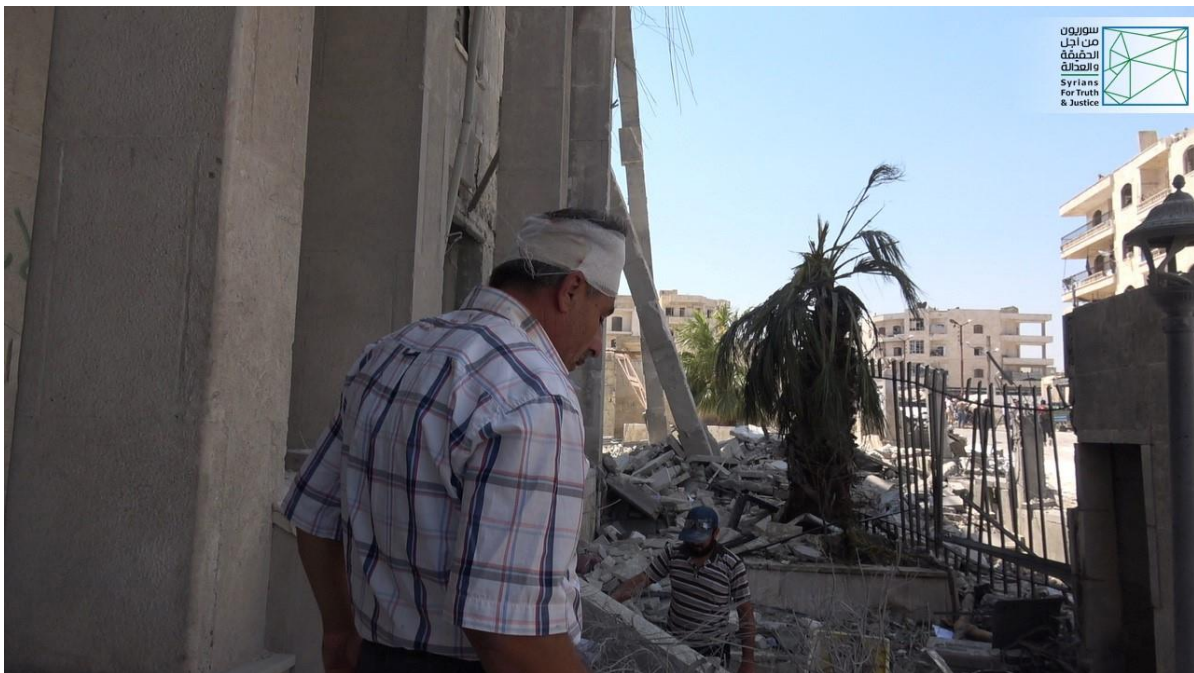
An image shows one of the locals who was wounded in the explosion that hit Idlib city on August 2, 2018.

"We displaced from Damascus countryside fleeing the shelling by the regular forces. but on August 2, 2018, while I was out, I learned that an explosion took place in the east neighborhood of Idlib where my family lives, so I hurried there and was shocked because of the extent of the destruction that affected my house. I also saw blood stains and I directly headed to the hospital where my mother-in-law had passed away. My wife and children had got wounds of varying degrees and the explosion had caused considerable damage to my house and it had destroyed my car that I was working on it to sustain my family."