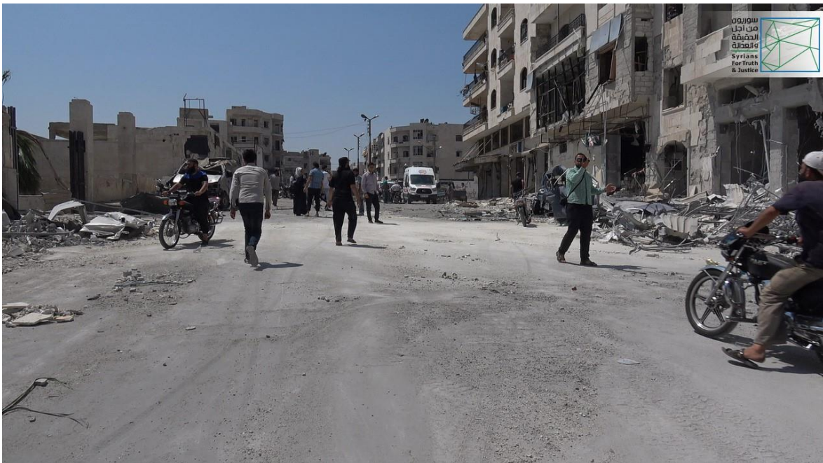
An image shows a side of the aftermath of an explosion by a car bomb in Idlib city on August 2, 2018.

"The explosion took place in front of the Central Bank located in the east neighborhood of Idlib city, specifically west of the industrial region near al-Mehrab Roundabout. The explosion was also close to the building of Ministry of Justice of the Salvation Government, and was a result of a car bomb parked on the road, and caused the death of a displaced woman from Eastern Ghouta and the injury of 25 others, including women and children who were displaced living in Idlib. Moreover, it left considerable material damage to the houses of the locals as well as to their property. We cannot decide the identity of the party that committed the explosion specially that no party claimed responsibility, but the Syrian regular forces could be the party after the explosion since HTS that controls the city has managed to arrest a cell affiliated with the Syrian regime recently."