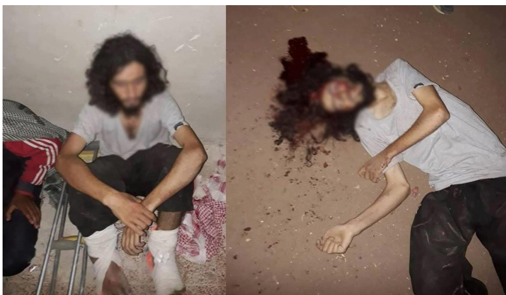
An image of one of the captives before and after the summary execution by the Reserve Forces (al-Quwat al-Radifa) on July 31, 2018.