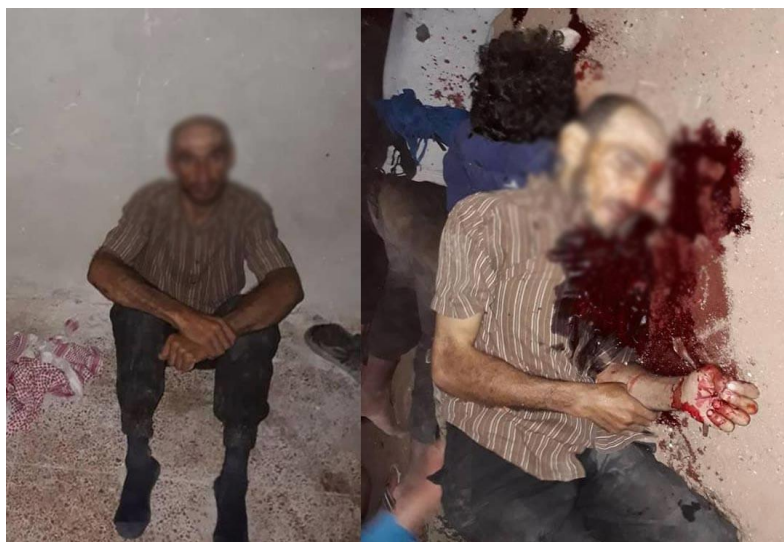
An image of one of the captives before and after the summary execution by the Reserve Forces (al-Quwat al-Radifa) in Hayt Valley on July 31, 2018.

There are about 55 elements of ISIS present in Hawd al-Yarmouk (basin) following the deal reached between the Syrian regular forces and ISIS to move about 1500 elements. Besides, estimated 1500 civilians are besieged in Koya Valley, according to al-Share'.