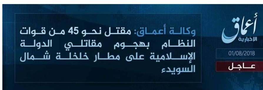
An image of an announcement showing the outcome of the military operation launched by the Islamic State against al-Sweida province, published by Amaq News Agency loyal to ISIS.