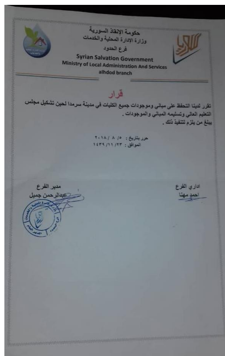
A copy of the decision issued by the “Salvation Government” about preserving the faculties in Sarmada city on August 15 th 2018.