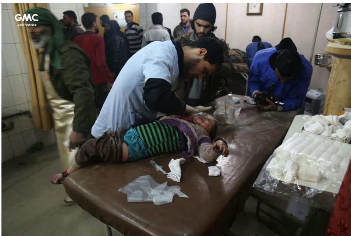
Some of the victims injured by shelling Kafr Batna town on February 6, 2018 .

Another video footage , published by Kafr Batna Coordination, said that it shows the initial moments following the air raids on Kafr Batna town on February 6, 2018.