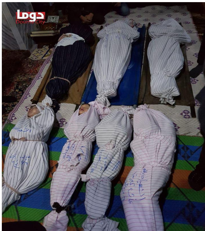
Some of child victims who died as a result of shelling a residential building in Duma city, on February 6, 2018,