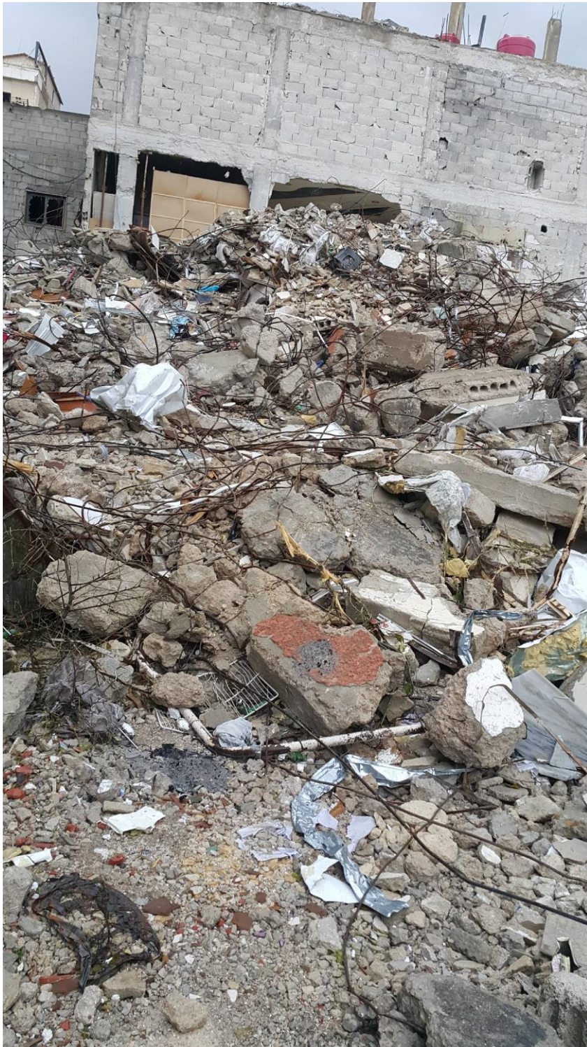
Exclusive photos for STJ showing the building were Duma 26 th of February 2018 massacre took place