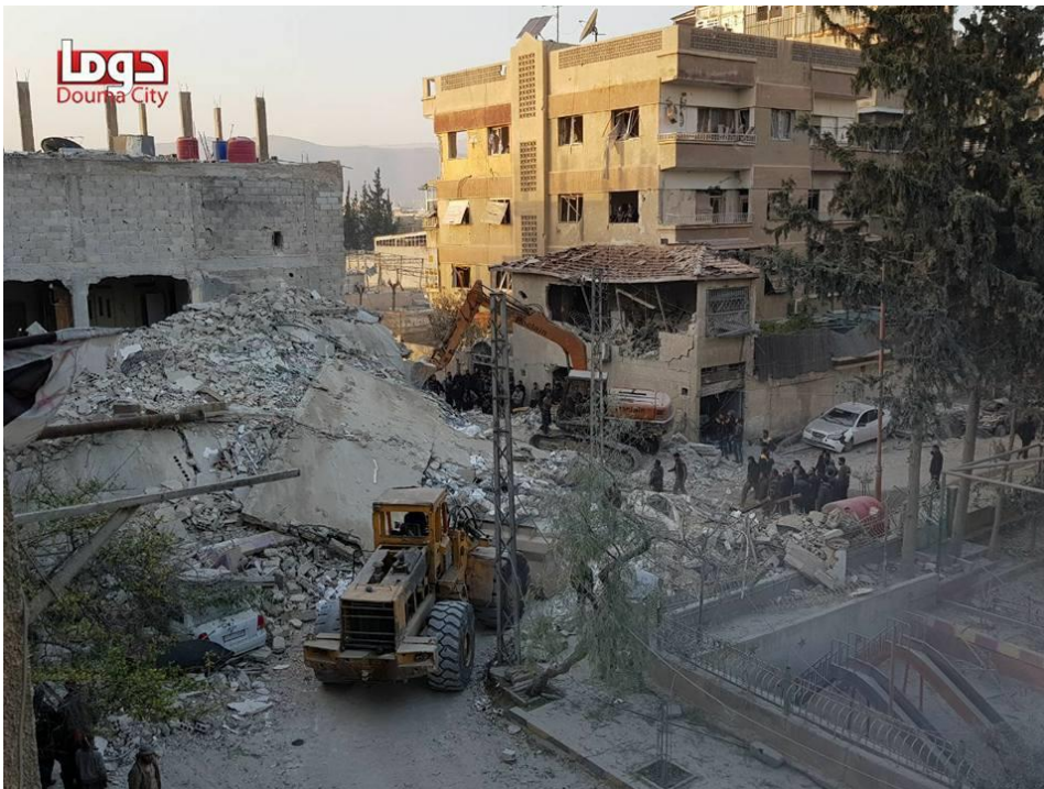
A side of the devastation caused by the bombing of a residential building in Duma city, on February 6, 2018.