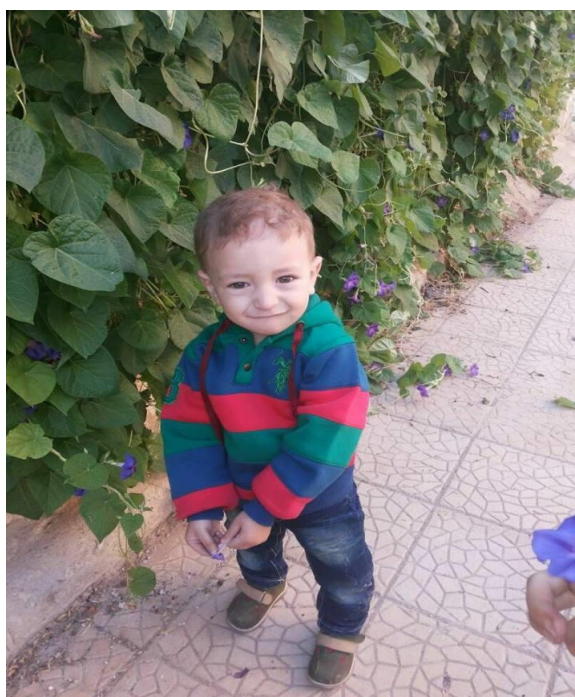
Some of the child victims who died as a result of shelling residential building in Duma city, on February 6, 2018, © Douma Coordination ,