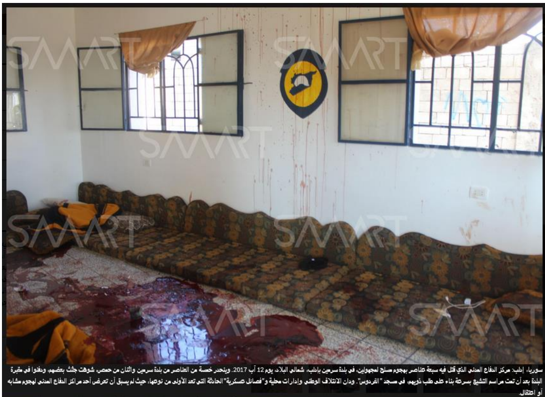
A room at the Civil Defense Centre in Sarmin located in Idlib, following the exposure of its members to assassination operation by unidentified gunmen on August 12, 2017.

This is not the first incident against the Civil Defense members, as in a previous occasion August 12, 2017, unknown gunmen stormed a Civil Defence Centre in Sarmin town located in Idlib, killed seven members and stole the entire equipment and machinery there, as the Civil Defence stated at the time. Local activists along with residents of the town accused persons, loyal to the Syrian regime, who had sneaked from both Fatah Army-besieged towns of Kafriya and al-Fu'ah, which are only 10 km from Sarmin. Other activists accused Jund al-Aqsa 2 and HTS of committing the assassination.