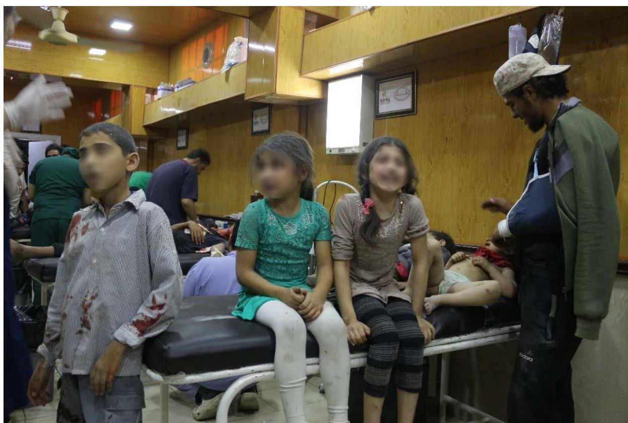
Images of some children victims who were affected due to the explosion of a car bomb in Idlib city on May 26, 2018.

One of the personnel in Surgical Specialty Hospital in Idlib, told STJ that on May 26, 2018, they received up to 40 injuries, more than 70% of them were children, and that the injuries varied between medium and serious, which meant that the death toll was not final and could be more than four persons because of some critical injuries. He added most of the wounded were affected by shrapnel in the head or in their entire body, and that preliminary information indicated that the car bomb could be a big vehicle due to the magnitude of the destruction it caused.