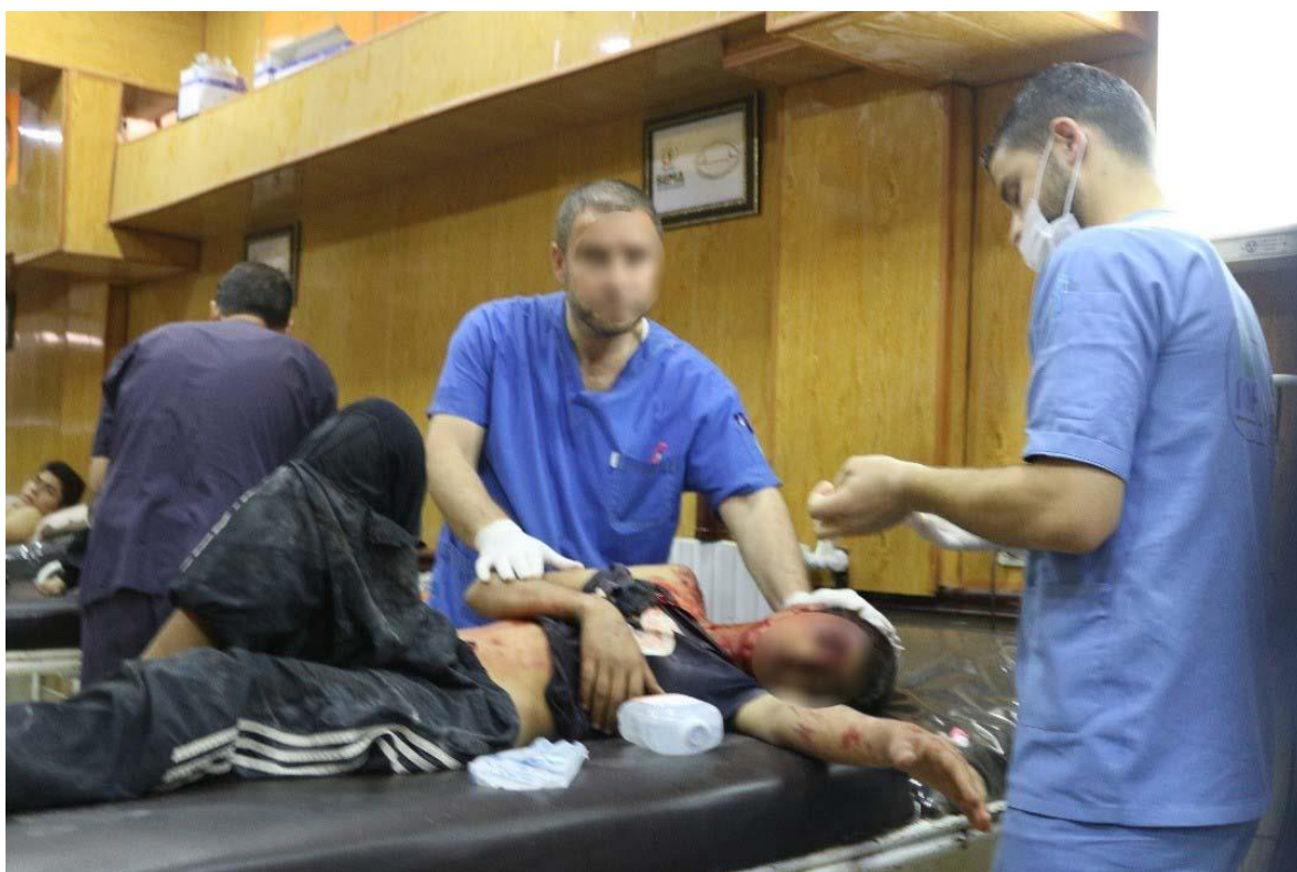
Images show some of the children victims who were injured in the explosion in Idlib city on May 26, 2018.