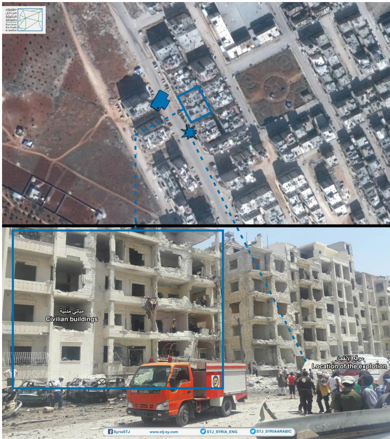
Analysis of visual evidence