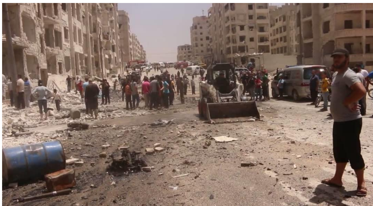
An image shows the devastation affected to the residential buildings in al-Thelatheen Street in Idlib due to the detonation of a car bomb on May 26, 2018.

"As soon as I arrived, I saw the Civil Defense teams pulling out four persons from the rubble. As for the injured, their number was too large, ambulances were evacuating them very quickly and then returned to transport others. A state of panic and fear prevailed among the townspeople, notably that the impact site was just a civil neighborhood, with no traces of other things."