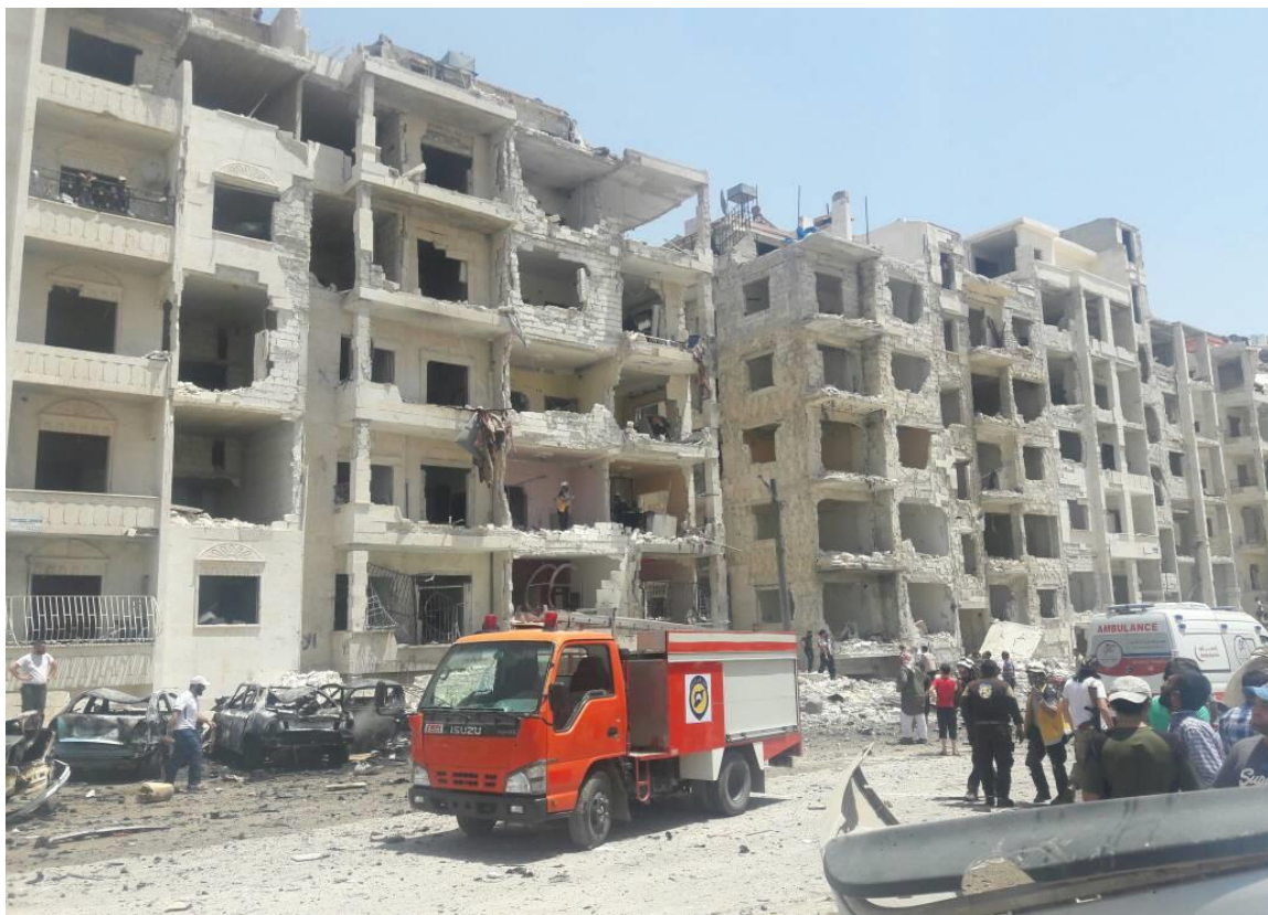
Images show the devastation affected to residential buildings in al-Thelatheen Street due to the explosion on May 26, 2018.