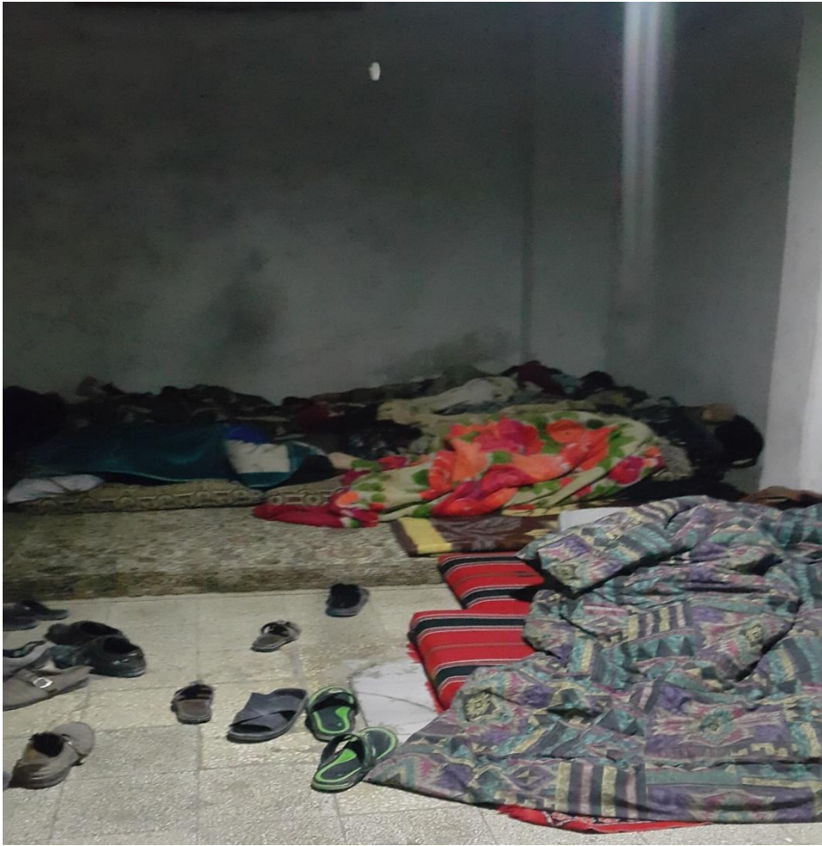
An image shows the dire conditions of many locals who shelter in the cellars.