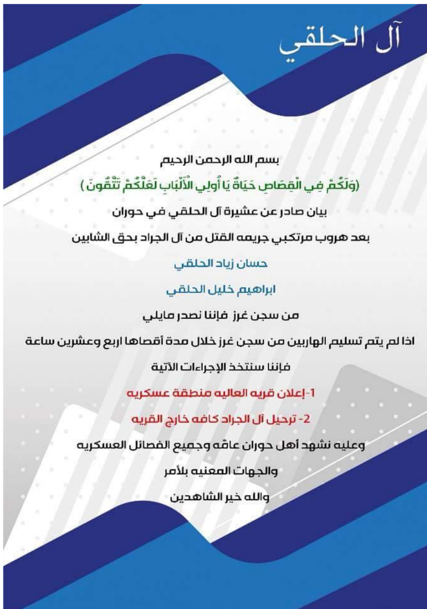
Image shows the statement issued by "al-Halaqi" family on March 16, 2018.

Armed clashes occurred between "al-Halaqi and al-Jaradat" families, in El Aliyah village next to Jasim city, on the very day that six prisoners of "al-Jaradat" family escaped, those who were convicted of murdering two youths of the "al-Halaqi" family, and had been sentenced to death. However, the other party lodged an appeal, which led to a delay in the execution of the sentence, which prompted the "al-Halaqi family" to issue a statement on March 16, 2018, in which it threatened to escalate if the prisoners did not surrender themselves.