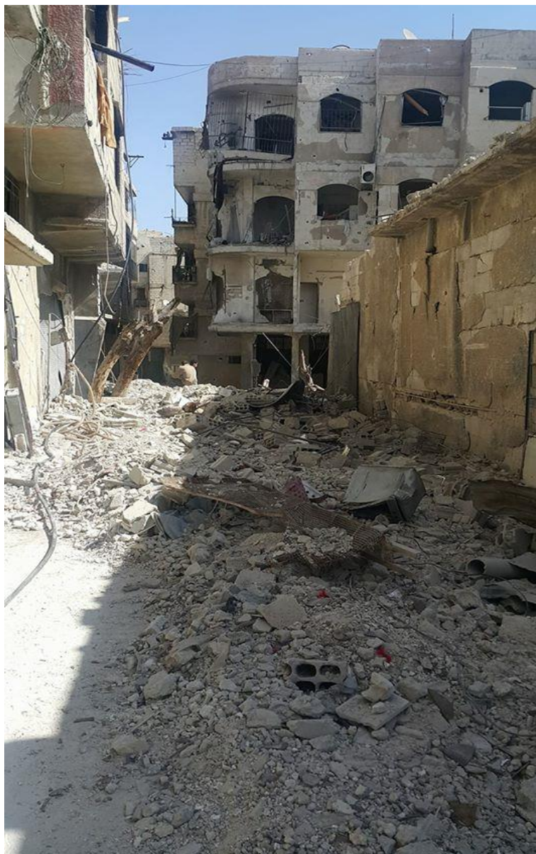
An image shows, which shows a side of the devastation in Hamoryah, following the violent shelling that took place during February 2018.