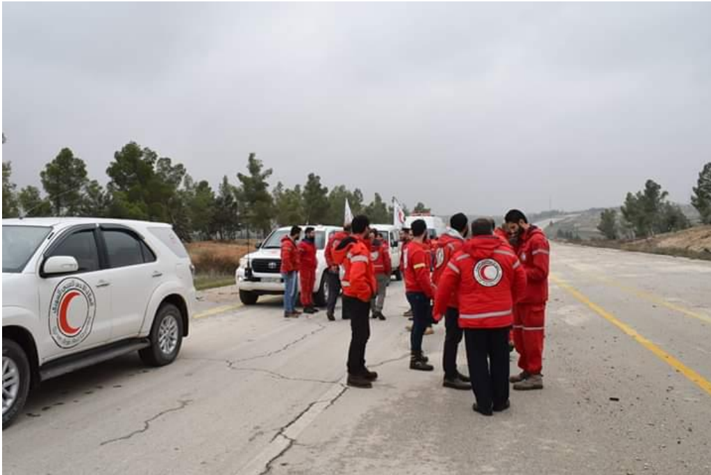
A side of the prisoner swap conducted on November 24, 2018.

Hamza al-Baker, a commander of an armed group in the Euphrates Shield area, confirmed to STJ that the exchange deal achieved under Russian-Turkish auspices, without the intervention of UN. He said: