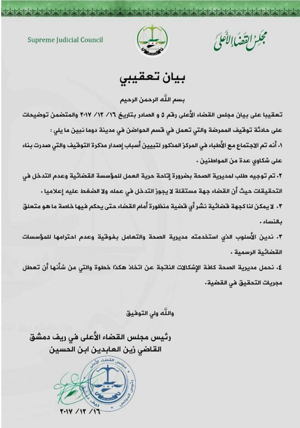
Image of the follow-up statement issued by the Supreme Judicial Council on December 16, 2017, in which it confirmed that meeting was ongoing with the doctors concerned to find out cause of the arrest, and called to allow the work of the judiciary.