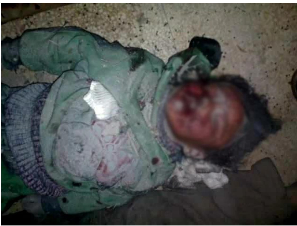
Images show some civilians killed in the shelling of a popular market in Mesraba on November 26, 2017