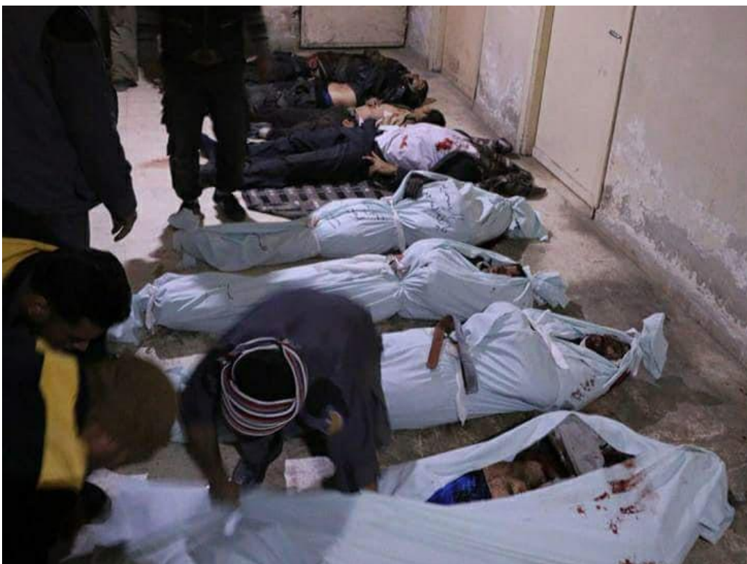
Image shows some of the civilian casualties resulted from the shelling of a popular market in Mesraba village on November 26, 2017