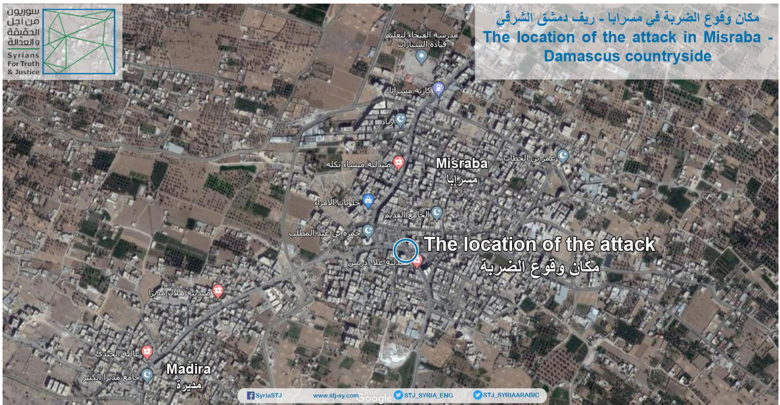
Satellite image shows the strike location, at the popular market in Mesraba village, Damascus countryside.

Ahmed said that the targeted market located in the midst of heavily populated civilian buildings, at the intersection of four roads, which connect several areas in Eastern Ghouta. Noting that a large number of those injured, died later, not only because of their serious injuries, but also as a result of the siege imposed on Eastern Ghouta several years ago by Syrian regular forces who deny medicines entry, furthermore, many of the wounded wish they would die to end their torture.