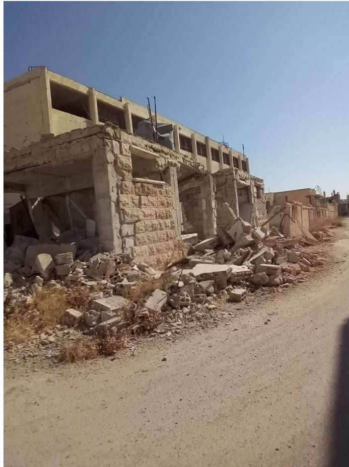
Damage caused to the Martyr Hussein Qassom School. on September 9, 2018.

These events were part of a broader campaign launched by the pro-government forces on Hama northern countryside, on September 4, 2018, which resulted in significant human and material losses 1 .