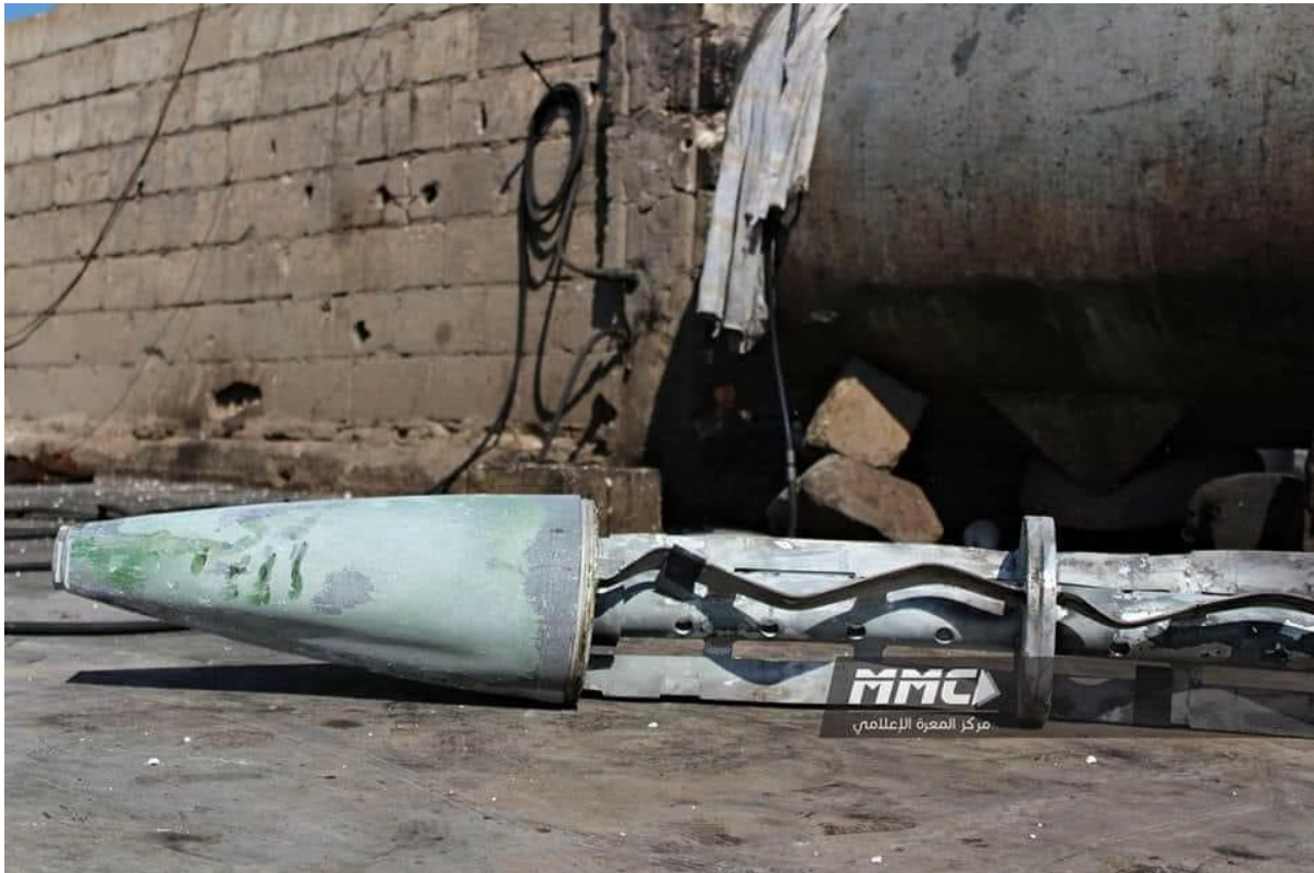
Remnants of a cluster bomb allegedly targeted Jarjanaz on September 10, 2018.

According to the Free Idlib Education Directorate, the schools were attacked with cluster munitions and resulted in the injury of six civilians including two pupils.