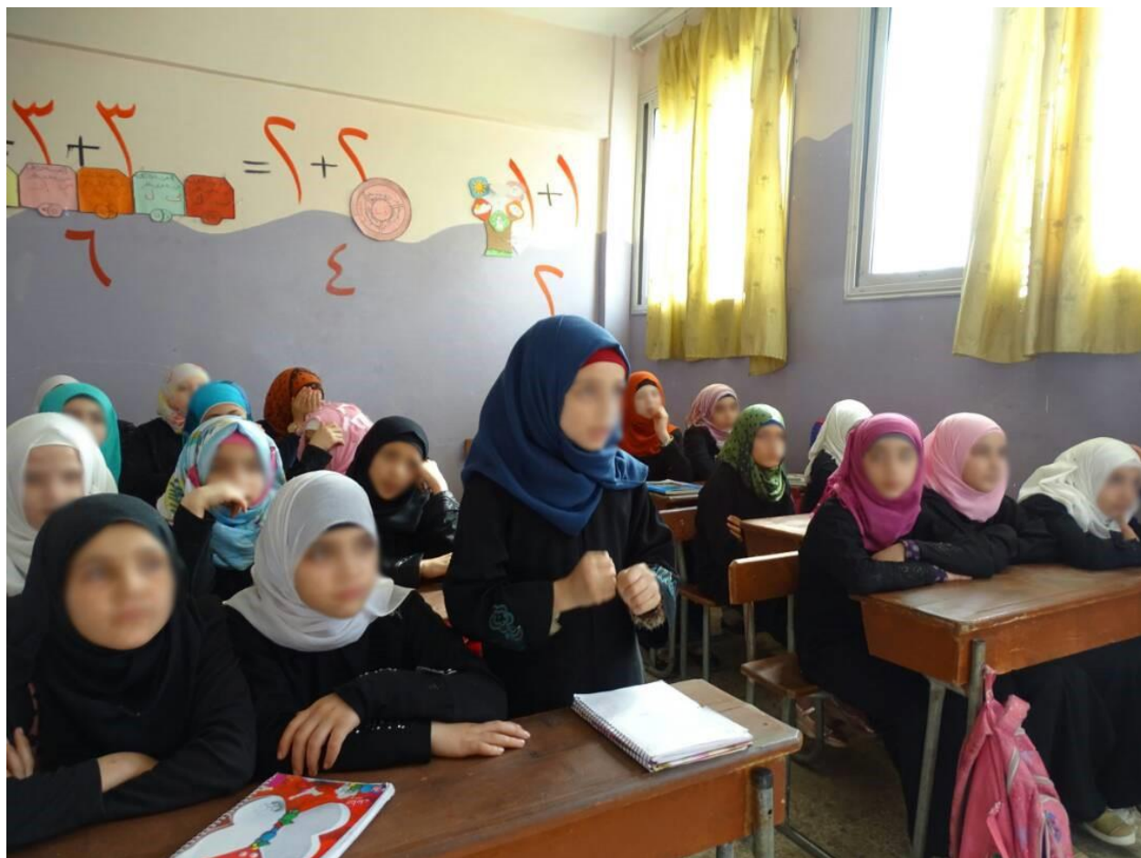
An image shows an aspect of the educational situation in Arihah because of the decisions of the "Committee of Promotion of Virtue and Prevention of Vice".

violates these instructions. There is no doubt that these beliefs affect our children negatively, and more often, when our children inquire about the reason of separating females from males in school, we got no answers. For our children, this is a big suffering, but we are forced to lead this life."