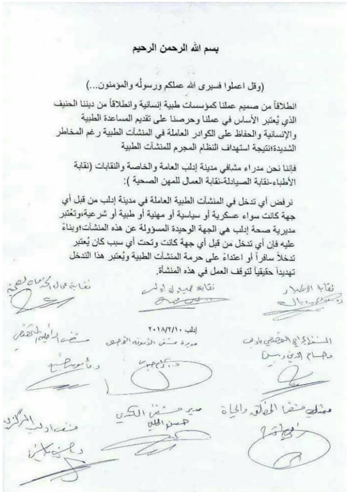
An image shows the statement issued by the associations of the doctors, pharmacists, and the medical facilities in Idlib on February 10, 2018.