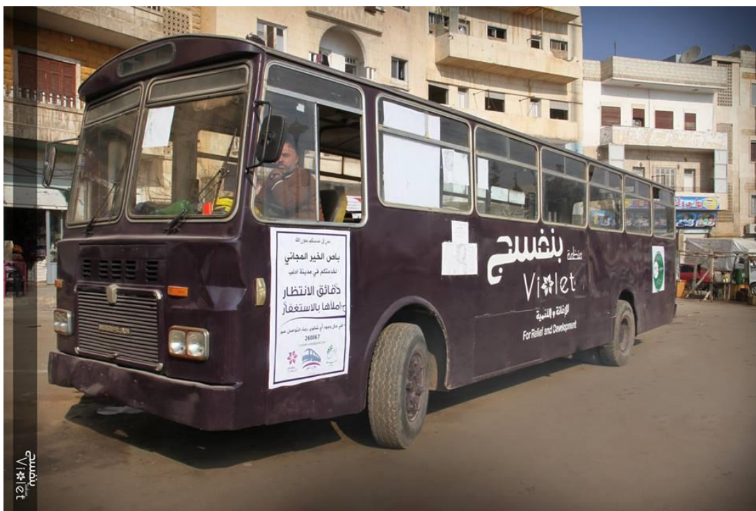
Image shows side of the work of the free al-Khair Bus in Idlib city.

"The idea of the project came after several studies and reports carried out by the Organization's needs assessment team. It has been found that many people in Idlib cannot use public or private transport in Idlib, due to its high prices, so through al-Khair Bus , those people can secure their needs regularly, especially the elderly and those with the special needs. However, Sawa'id al-Khair elements affiliated to HTS stopped the drivers who were working on the free interior transport project on February 7, 2018. First, they took them to an unknown place and then released them several hours later, but without allowing to resume the project once again, all that under the pretext of preventing mixing between females and males. In addition, Sawa'id al-Khair halted the city's interior transportation work until an agreement is reached."