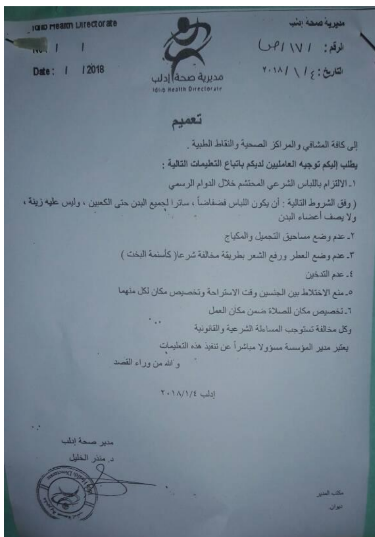
Image shows the decision issued by the "Directorate of Health" within the "Syrian Interim Government" ran by the opposition in Idlib province on January 4, 2018, which emphasized the need to comply with the Sharia dress at hospitals.

As a response to the previous generalization, a number of doctors and hospital managers in Idlib City issued a statement on February 10, 2018, refusing the interfere in the medical institutions affairs. In this regard, a doctor from Idlib said: