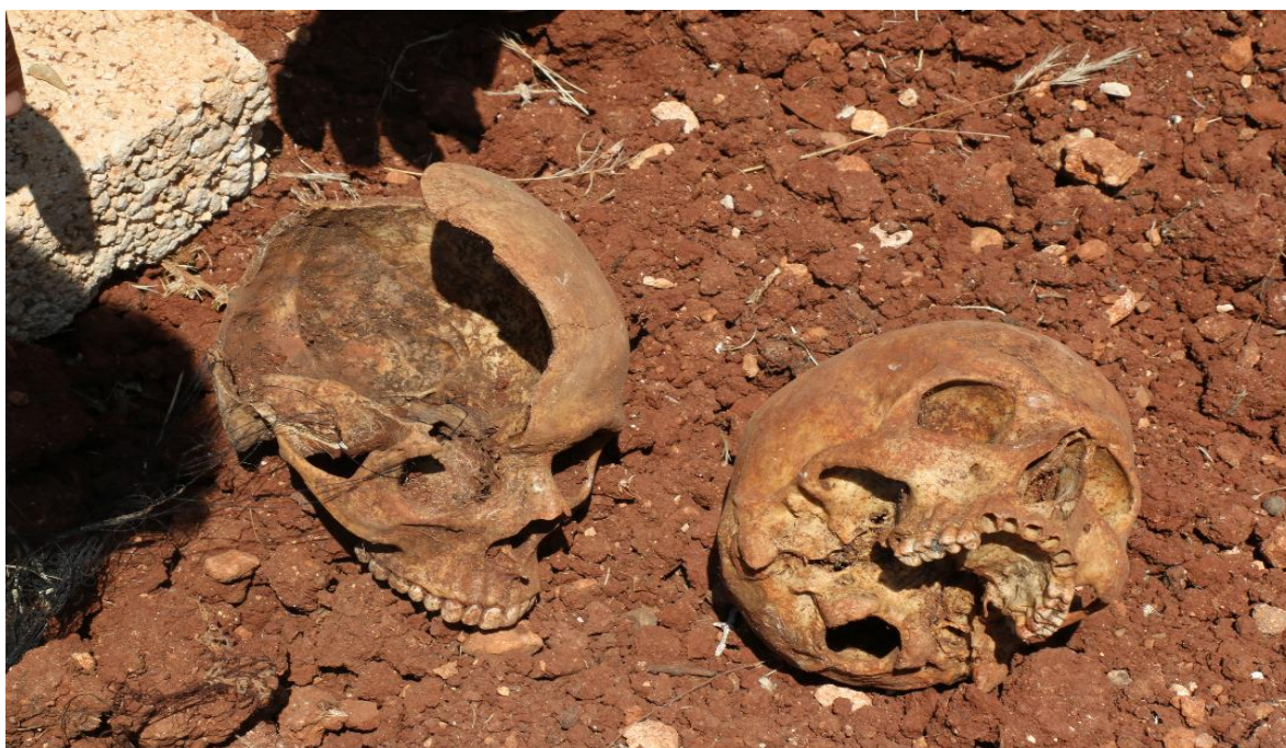
Skulls from the remains found, the one on the left smashed because of a shot.