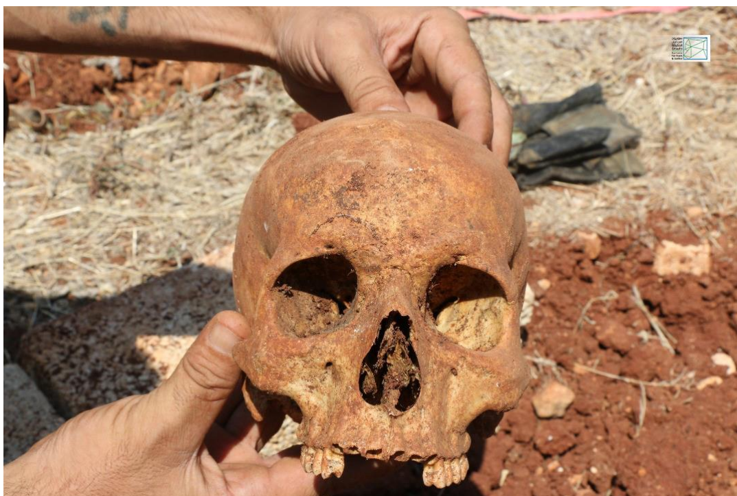
A side of the remains found on Aug. 29, 2018