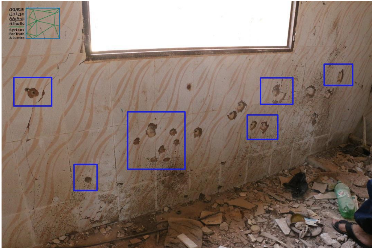
A side of the house where the three men were shot in kneeling position, according to the forensic expert Hasan Obeid, as the marks of the bullets were down at the end of the wall.

An activist from Khan al-Asal confirmed that regime forces backed by the Air Force Intelligence stormed Khan al-Asal and executed some civilians there in late 2012.