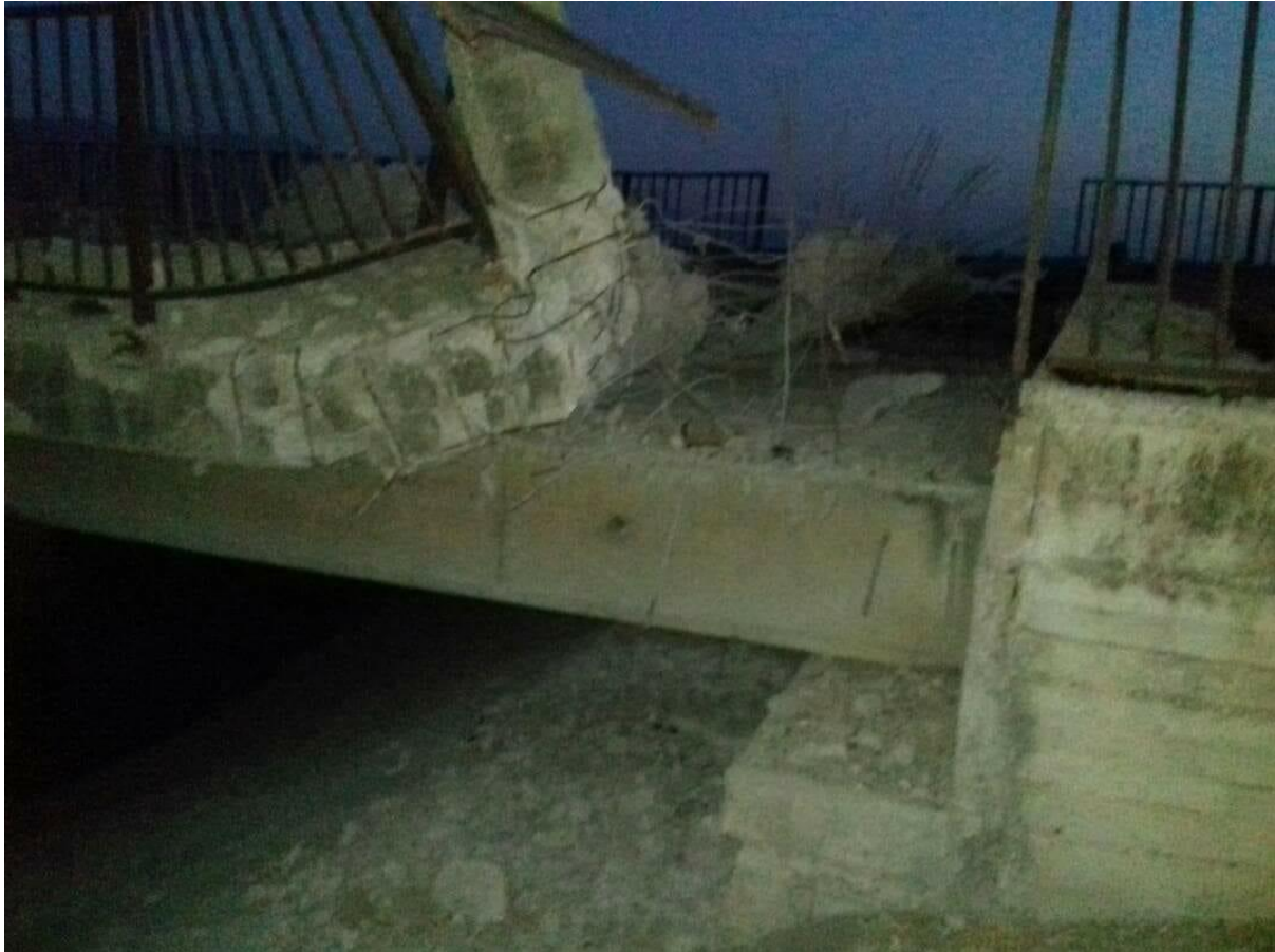
Al-Tuwayni Bridge in Sahl al-Ghab, Hama after being bombarded by the National Front for Liberation bombarded on September 5, 2018.

On September 5, 2018 the National Front for Liberation bombarded al-Tuwayni Bridge that links the rebel-held al-Tuwayni village to the Regime-held al-Hurra and al-Khandaq villages, northwestern Hama.