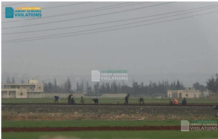
HTS agents dismantling a railway between Kafr Halab and al-Zerbah villages, southern Aleppo. Published on February 12, 2018 by Jabhat al-Nusra Violations Documentation Team in Syria.