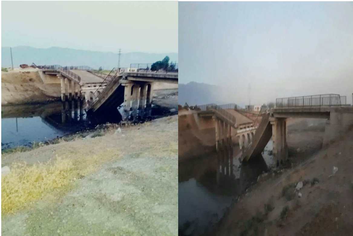
Bait al-Ras and al-Sharia bridges in Sahl al-Ghab after being bombed by the National Front for Liberation on August 31, 2018.