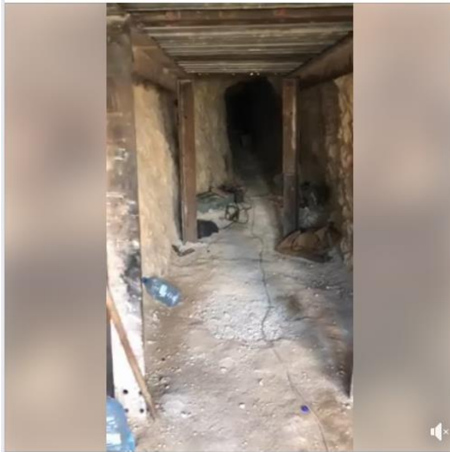
A still taken from the footage published by local activists on August 30, 2018, showing pieces of the railway used to strengthen the tunnel.