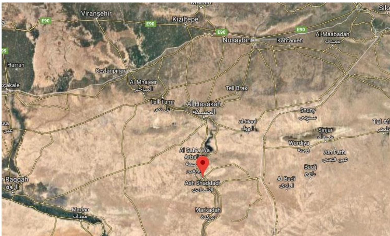
A satellite image showing the location of al-Shadadi town.