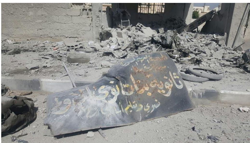
An image shows the aftermath of destruction inflicted on Nawa 1 st High School for Girls located in Nawa city, Daraa. Published by the Civil Defense on June 28, 2018.

For his part, Imad al-Bateen, the governor of the Free Daraa Council, said in an interview with STJ on July 4, 2018, that airstrikes hit the hospital in Tafas city causing its complete destruction on July 2. He added that all schools and service institutions in cities of Nawa, al-Harak, Busr al-Harir and Nahta were completely destroyed as well by airstrikes. However, the schools in cities of Kiheel and Giza were partially destroyed as a result of similar raids.