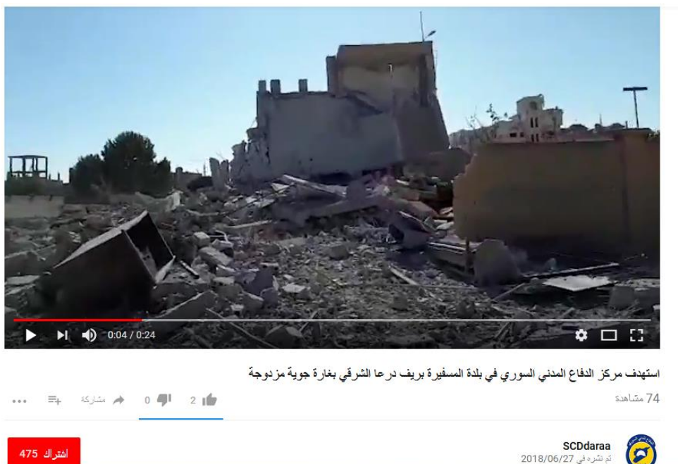
An image taken from a video footage published by the Civil Defense on June 27, 2018 showing the destruction of its center in al-Musayfrah city.

For his part, Imad al-Bateen, the governor of the Free Daraa Council, said in an interview with STJ on July 4, 2018, that airstrikes hit the hospital in Tafas city causing its complete destruction on July 2. He added that all schools and service institutions in cities of Nawa, al-Harak, Busr al-Harir and Nahta were completely destroyed as well by airstrikes. However, the schools in cities of Kiheel and Giza were partially destroyed as a result of similar raids.