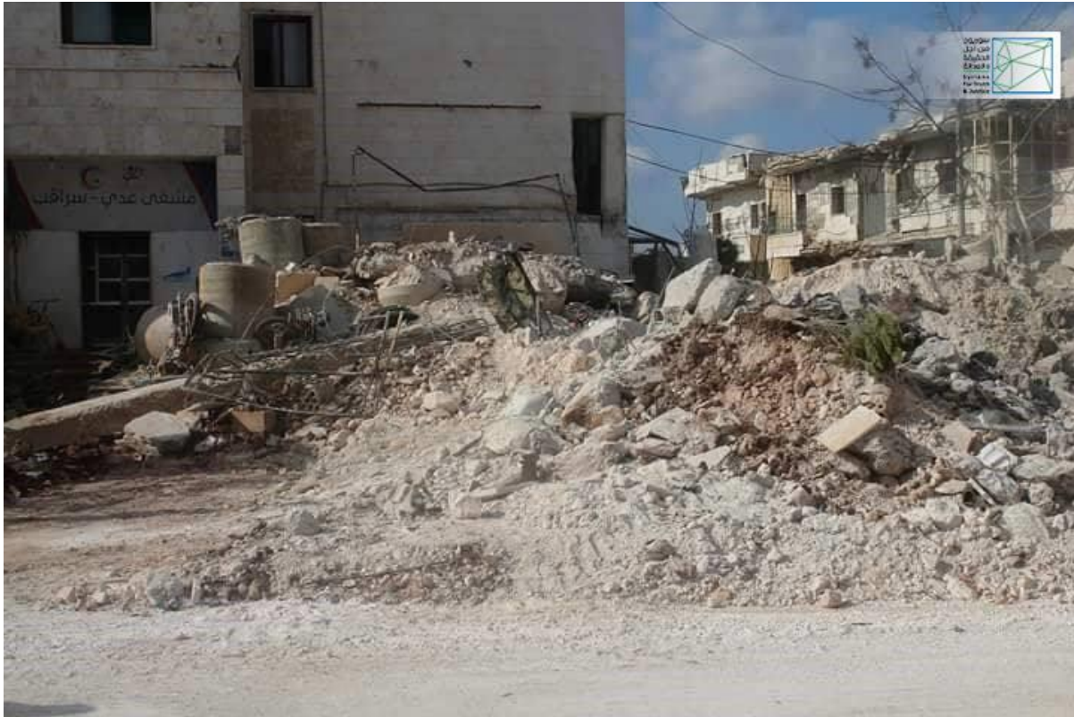
The Uday al-Hussein hospital in Saraqib city.