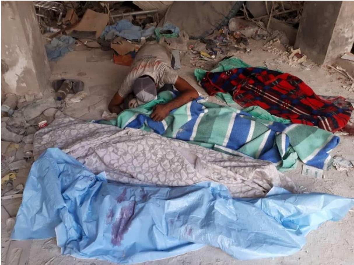
Civilians casualties, fell after the violent attacks of September 4, 2018, on Jisr al-Shughur.