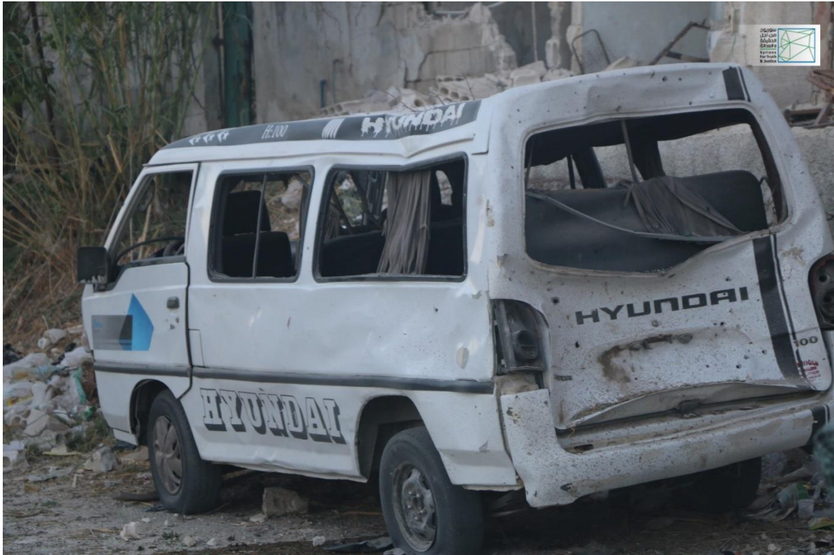
Damage caused to civilian property in Jisr al-Shughur, following violent attacks of September 4, 2018.

STJ documented the names of some victims of the violent bombardment on Jisr al-Shughur, on September 4, 2018: