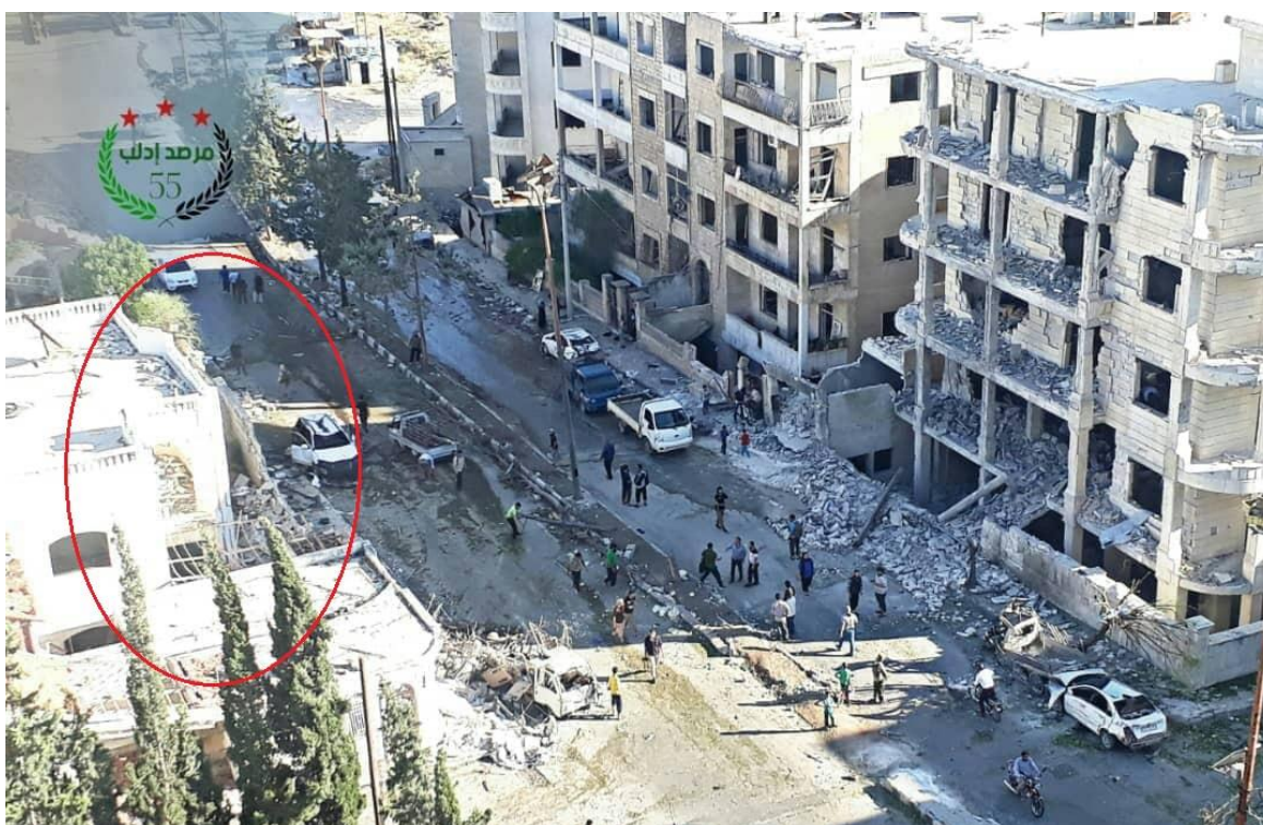
Image published by "Idlib Observatory 55", shows the HTS headquarters, as confirmed to STJ by the eyewitness Ahmed Rahal.

"The HTS headquarters is located near the Carlton Hotel, and it is heavily fortified, which protected it from the explosion affects and that in turn excludes the possibility of the fell of HTS agents inside the building. Note that HTS has evacuated and closed the headquarters following this explosion" .