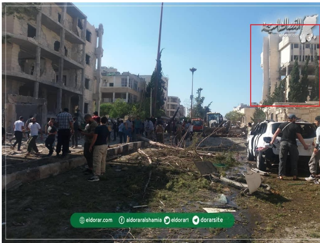
Image shows the Carlton Hotel building near the site of the explosion, which hit the city on June 21, 2018, according to eyewitnesses.

"When the civil defense teams and civilians rushed to the site to help the wounded resulted from the first explosion, the second explosion occurred in the same place, near HTS headquarters, and immediately killed a civil defense member, a child, a woman and a man".