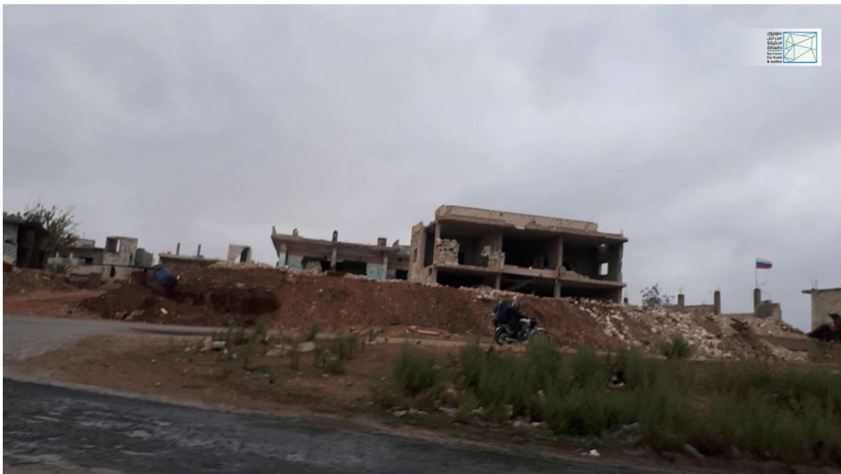
The photo shows a military headquarters of the Syrian regular forces and the Russian forces, where the Russian flag is raised, appearing to the right corner. Taken on: November 4, 2018.

The security services and the regular forces also seized several cars and machinery upon entering the city of al-Rastan and many of the owners of these properties paid money to get them back, resorting to intermediaries working for the security services, STJ's field researcher added.