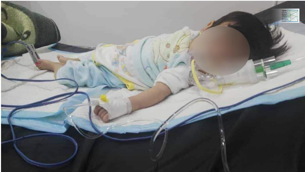
The released infant on treatment in one of Hama city’s hospitals.

“At 11 pm sharp, an element from the Military Security Branch called me. He asked me to refer to the branch to take my niece. I went there accompanied by my older brother. We waited at the branch’s external door until an element appeared and opened the door while carrying a black bag, in which he placed the infant. He gave me the baby and asked me to sign that I received her. I did. Scared, we raced to the car. The baby was in a tragic condition; her body was cold and wrapped in a black bag. They used worn-out clothes as diapers. We immediately took her to the hospital to be treated urgently.”