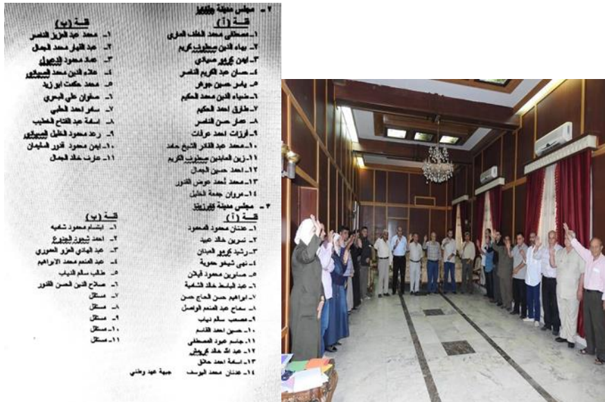
An image circulated by activists, showing names and members of the Kafr Zita City Council, affiliated with the Hama Provincial Council under the Syrian government.