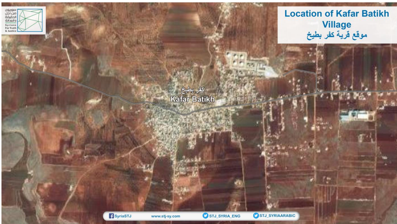
A satellite image illustrates the geo-location of Kafr Battikh town.