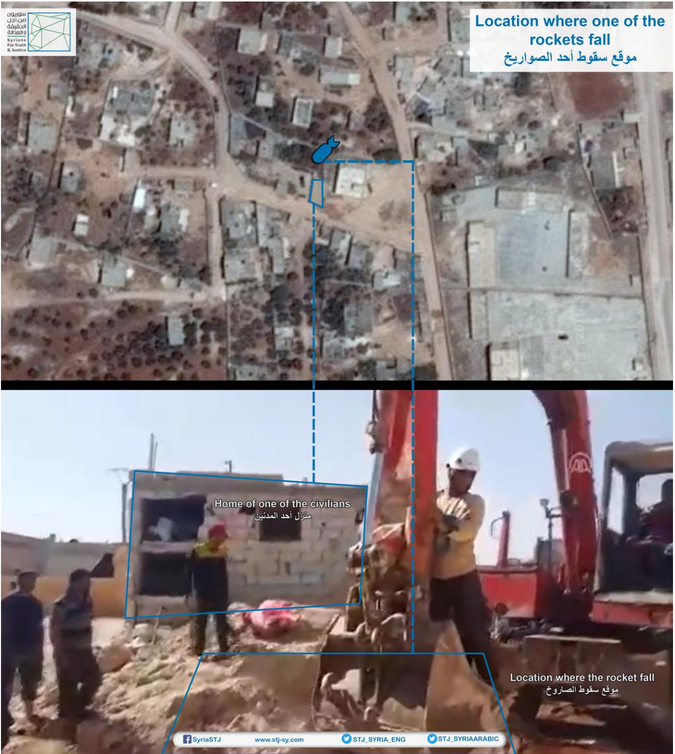
Analysis of visual evidence about the Kafr Battikh massacre on March 21, 2018.