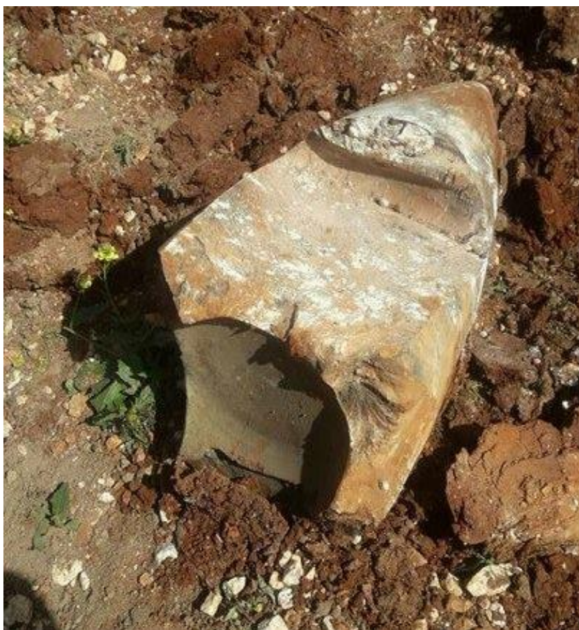
An image shows a remnant of a rocket used in bombing a shelter in Kafr Battikh town on March 21, 2008.

"On the morning of that day, we heard through the walkie-talkie that Russian warplanes hovering over the town. Only moments, they targeted the southern outskirts of Kafr Battikh. Immediately, the schools head teachers sent the students home fearful of targeting the town again. Our house is close to the town's primary school, and in the same neighborhood, there is a shelter, which is an underground hole dug by people in a manual form. Meantime, while children and women were going down to the shelter, including my father who stood in front of the door to watch the aircraft movement in the sky, the aircraft targeted the shelter directly, killed my father on the spot, and closed the shelter's door, which was the only outlet. Everyone became under the rubble due to the rocket explosion. After that, the civil defense teams went to the strike location, but getting them out alive was a very weak hope. I have had very difficult moments waiting to get my kids out; there was nothing to do but to wait. Three hours later, the civil defense teams were able to pull out all the children and women, but all of them were dead."