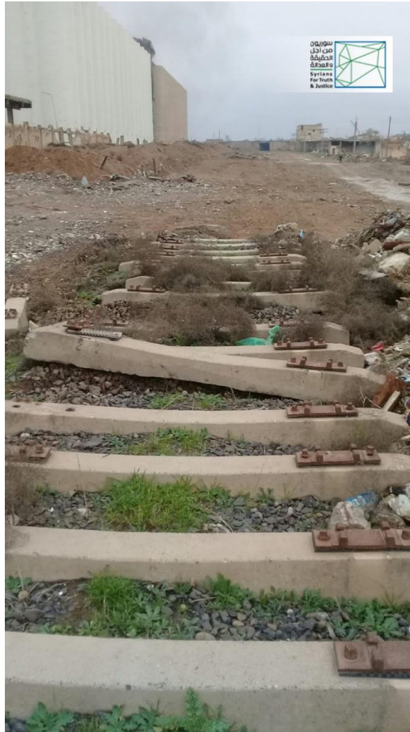
The railway dismantled, near the grain silos to the north of the Raqqa city. Taken on: November 2018.

About the issue, “Aboud al-Khalaf,” the media official of the “Raqqa City Reconstruction Committee,” clarified that the reconstruction process has nothing to do with the dismantling of the railway, for there are not any projects including the current work at the railway, adding: