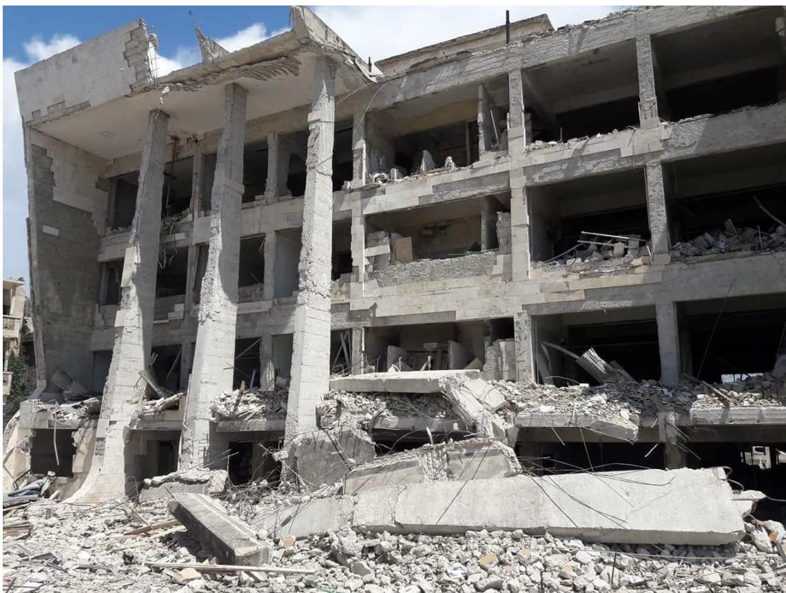
An image shows some of the devastation in the middle of Idlib city following the explosion on May 12, 2018.