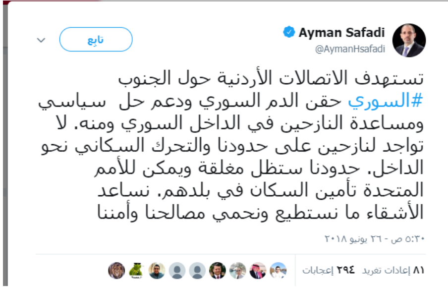
The Jordanian Foreign Minister Ayman Safadi's tweet.

The Central Channel of Hmeimim Military Base announced through a post on its Facebook official account 3 on June 26, 2018, that the agreement on the southern de-escalation zone in Syria was terminated.