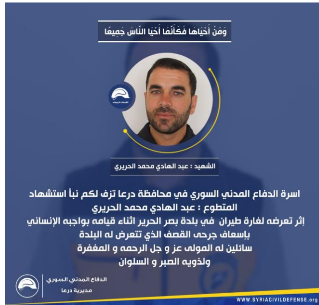
Image published by the civil defense of the volunteer who was killed as a result of an airstrike on Buser al Harir town on June 26, 2018.

For its part, the United Nations Office for the Coordination of Humanitarian Affairs (OCHA) expressed “alarm” at recent reports of civilian deaths and injuries including children in Daraa Governorate, since the government forces launched an offensive to restore rebel-held areas in southwest Syria. Noting that the lives of some 750, 000 people in danger due to fighting on the ground and bombardments from the air.