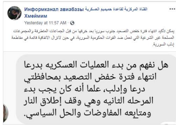
The Facebook post of The Central Channel of Hmeimim Military Base .

The Central Channel of Hmeimim Military Base announced through a post on its Facebook official account 3 on June 26, 2018, that the agreement on the southern de-escalation zone in Syria was terminated.