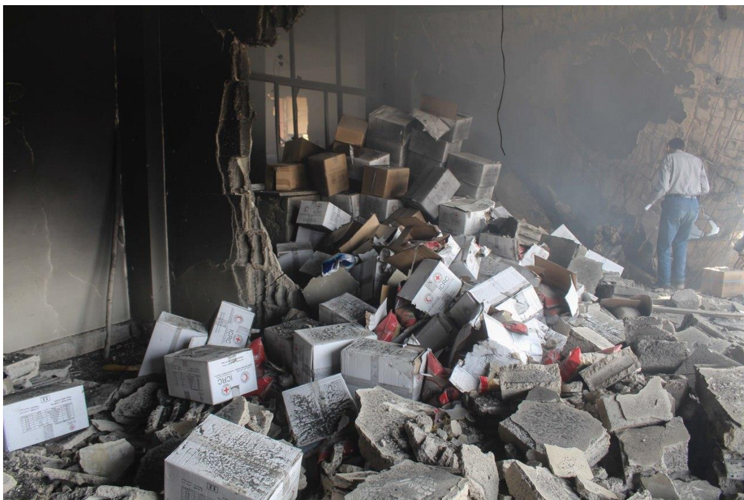
Image shows a side of the damage caused to the UN assistance in one of the warehouses of the Local Council of Douma, following the aerial bombardment of 19 March 2018.

The Syrian regular forces had already bombed a food warehouse of the Local Council of Douma on November 15, 2017, which resulted in the destruction of a part of the UN aid stored within it, according to a previous report prepared by STJ.