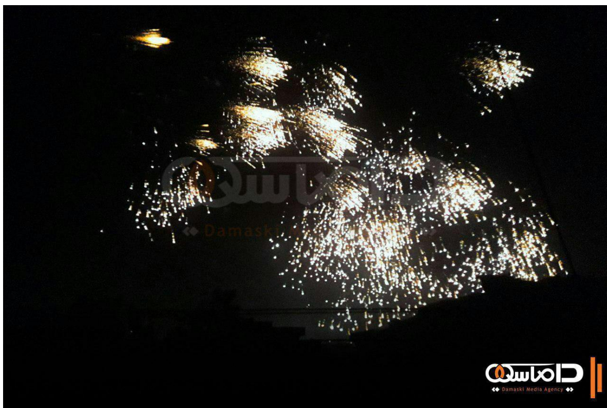
Image shows a side of shelling Douma with weapons loaded with phosphorous-like incendiary substance on March 19, 2018.

"The sky of Douma lit up as a result of the explosion of these rockets as if the night turned to day!, which made the people feel terrorized. Several neighborhoods in the city were targeted with rockets, which led to many fires, where an entire neighborhood, adjacent to the Souq Al-Hal in Douma, had been burnt. The rockets were fired on various parts of the city, which seriously hampered and confused the medics, especially since the fires began to devour the houses gradually and no one knows what to do."