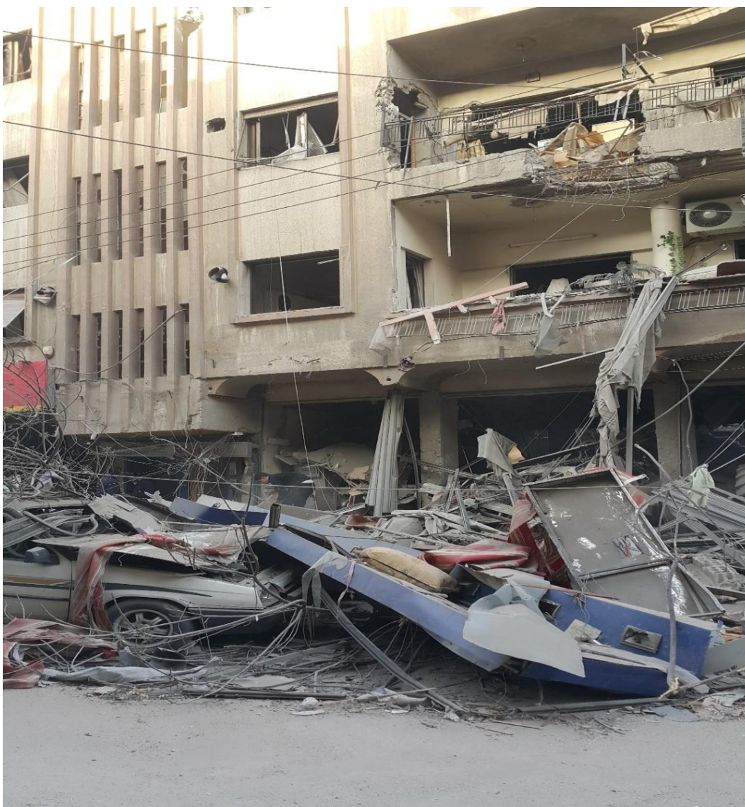
Image shows a side of the devastation caused to Douma as a result of the violent bombardment of March 18, 2018.