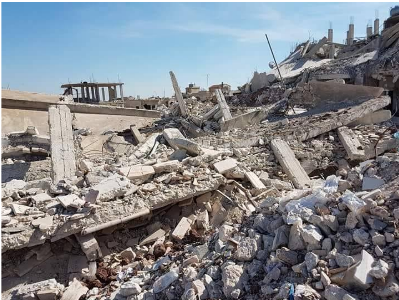
Image shows a side of the destruction in Kafr Zita Hospital, Hama countryside, following aerial bombardment on April 7, 2018.

"Nidal Qattan", a worker at Kafr Zita Hospital, told STJ that the time interval between the two raids carried out by the warplanes was very short, noting that the first raid caused a complete blackout in the hospital, while the second caused its destruction and put it completely out of service. Pointing out that the hospital workers reconstructed it in spite of the enormous material damage.